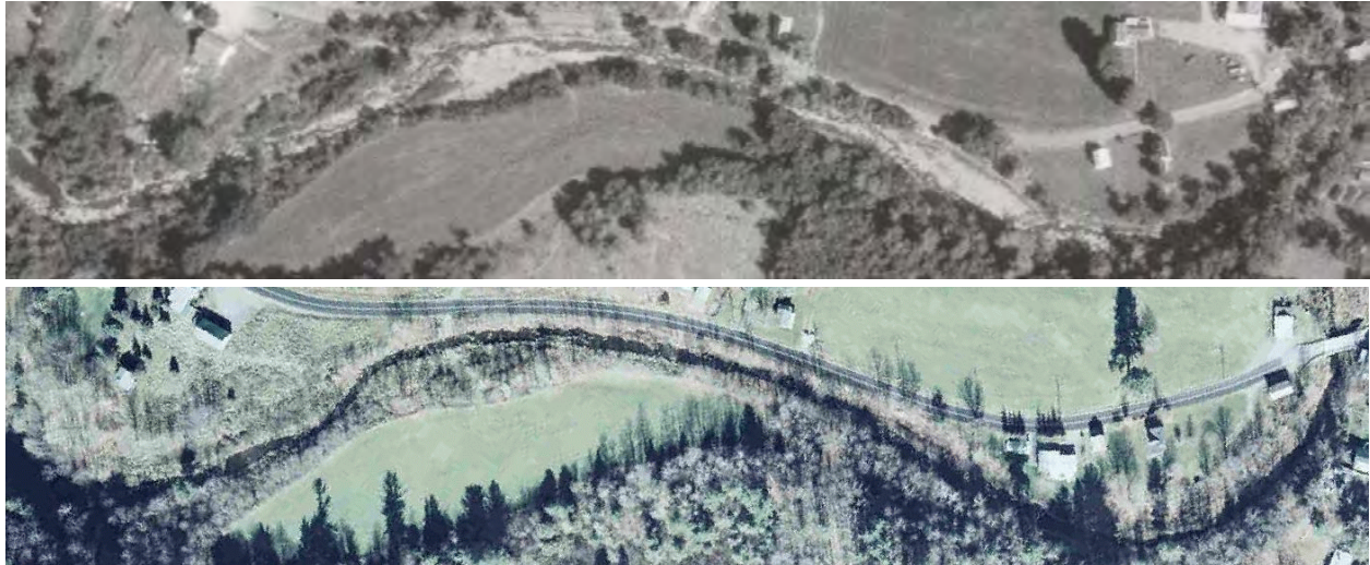
Figure VI-19: Review of aerial photographs from 1959 (top) and 2000 to assess flood control impacts on stream form and function.

a distinct difference in sediment storage within the segment ( Figure VI-19 ). In the 1959 photo (top), numerous point bars, mid channel gravel bars, and several side bars can be seen. This is characteristic of an active alluvial system with gravel and cobble being stored temporarily during transport from the headwaters to the Schoharie Creek and Schoharie Reservoir. By 2000 (bottom photo), these depositional features are notably absent, and the riparian vegetation has grown in stream-side areas that were once too active to be colonized by vegetation. The absence of in-channel sediment features (such as point bars) is a classic response to impoundments because they capture and trap the natural sediment supply from above. The aerial photographs also indicate a clearly discernable change in overall channel stability. In the 1959 photo, the lack of riparian vegetation and active erosion can be seen in several areas. Because the flood control dam has limited higher flows through the segment, the channel is experiencing very little streambank erosion or other adjustment processes.