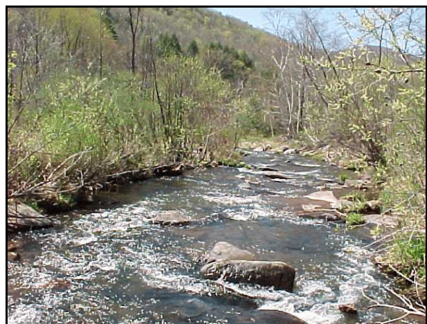
Figure VI-20: Riparian vegetation to the stream's edge.

Management Segment 2 was further subdivided into three reaches to facilitate data collection and analysis ( Map VI-3 ). In the following sections, the GCSWCD has summarized the stream condition, on-going stream processes, and recommendations for this segment.