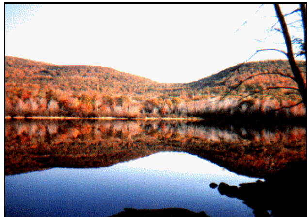
Figure IV-18: Local water resources such as Lake Heloise at the White Birch Campground are important to the economy in the watershed.

In addition to the Batavia Kill, the watershed also includes numerous small lakes and ponds which are important as recreational and habitat resources. The principal uses of these surface waters include fishing, snow making, and private recreation such as swimming. Some of these surface waters also contribute to the NYC water