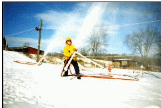
Figure IV-19: Water used for snow making at Ski Windham accounts for 55% of total average water use in the watershed.

While there are limited withdrawals from surface waters for commercial or private use, the snow-making operation at Ski Windham is the single largest user of water in the Batavia Kill watershed. Regulated under a permit with NYSDEC, Ski Windham is limited to taking a maximum of 7 cubic feet per second (3,142 gallons per minute) from the Batavia Kill and the ski area must monitor withdrawals on 15 minute intervals during the period between November and February. Investigations by Heisig found average daily withdrawal of 2.2 million gallons per day while Ski Windham reported an average seasonal pumpage of 139 million gallons (1999). Ski Windham is consistently within the limits set forth in their permits.