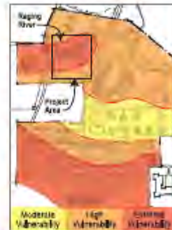
Town of Hazardville Composite Loss Map developed previously during risk assessment (see FEMA 306-2).

Losses avoided by acquisition and demolition of flood-prone structures