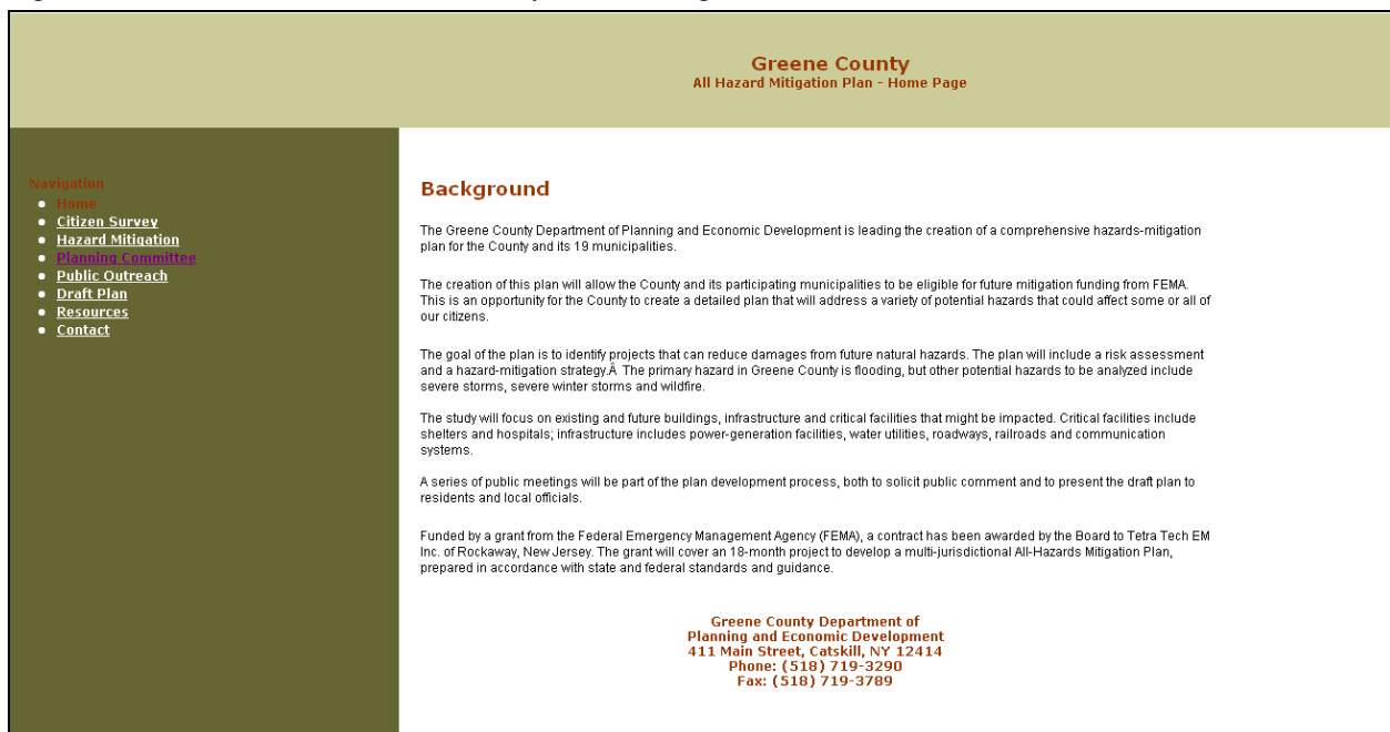
Figure 3-2. Screenshot of the Greene County Hazard Mitigation Plan Public Website