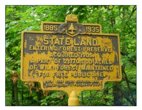
State Land historical marker

In 1904, the Catskill Park was designated, establishing a boundary or 'blue line'