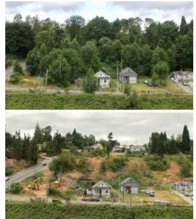
IN 2002, FEDERAL AND STATE AGENCIES cut and chipped some 1,000 trees in a neighborhood outside Seattle (before and after, above) to eradicate a voracious invasive insect: the citrus longhorned beetle, which was discovered on imported maple trees at a local nursery. State agencies, municipalities and private landowners often bear significant financial burdens—through no fault of their own—when imported nursery plants carry insects and diseases into the country.

As these examples illustrate, the costs of invasive insects and diseases introduced via imported nursery stock go far beyond federal dollars expended in efforts to control them. First, there are direct losses to horticultural importers when newly introduced pests damage their crops. Second, quarantines imposed to contain the pest can require the destruction of nurseries' inventory and the disruption of sales. Third, as the pest becomes established and spreads, landowners unrelated to the original importer suffer economic losses from the reduced productivity or outright death of infected trees and shrubs. Finally, the removal of infested trees creates substantial burdens not only on federal agencies but also on state governments, municipalities and homeowners. For example, although not introduced via nursery stock, the Asian longhorned beetle is a non-native insect currently causing great damage in New Jersey and New York. If it spreads, it could create an estimated $669 billion in costs for municipalities across the nation. 42