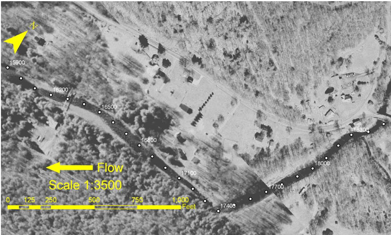
Figure 27 Management Unit 7 Stream Morphology Reference