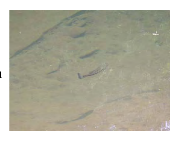
Largemouth bass in the East Kill, summer 2006.

It should be noted that a highpredatory warm-water species was sited often during the 2006 assessment in areas that would typically support a cold water fishery. These largemouth bass were stocked or escaped into the stream from adjacent ponds and could compete with trout for resources. However, they may also migrate to more suitable habitat conditions and/or suffer high mortality rates during the cold winter months.