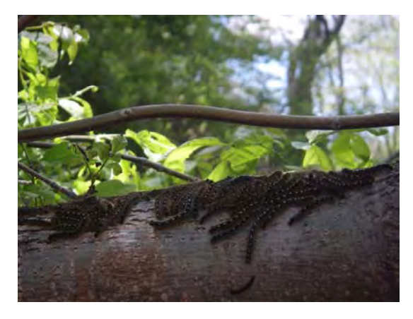
Tent caterpillars along the Schoharie Creek, summer 2006.

our eastern hemlock ( Tsuga canadensis ) populations. Once infested, hemlock mortality rates range between 50%-99% (Orwig, 2002). The plant species most likely to replace hemlocks are hardwood tree species and possibly other invasive species. Ultimately, this will have a dramatic effect on the structure of these communities. For example, the distribution and abundance of brook trout and diversity of aquatic insects will likely decline