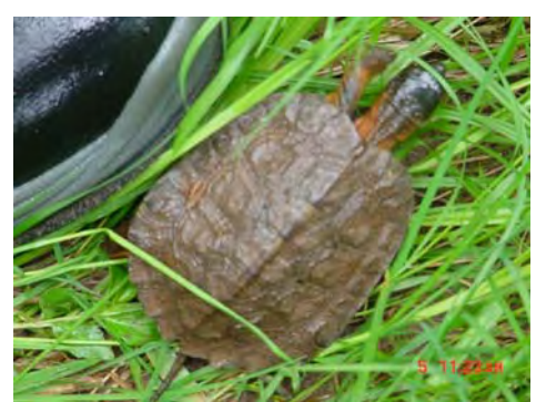
Small wood turtle (Clemmys insculpta) spotted along the Schoharie Creek, summer 2006. The wood turtle is a species of special concern in New York State

tiger beetle and timber rattlesnake are disappearing from the Catskills. Beaver, pileated woodpeckers, and bald eagles were once gone from this region due to over hunting, habitat loss, and pesticide poisoning respectively, but have since returned with reduced hunting pressure, an increase in second-growth forests, and a ban on DDT. Some species, such as the bobcat, black bear, river otter and osprey are less common than they were prior to European colonization. However, other common species, such as the white tailed deer,