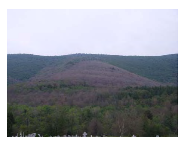
Tent caterpillar damage within the Schoharie Watershed, summer, 2006. Favorable climatic conditions were good, so many of these trees probably grew a second growth of leaves after the caterpillar population dwindled in late June.

Native pests often have native predators that control their populations. For example, the forest tent caterpillar ( Malacosoma disstria ) can cause a large amount of damage to Catskill forests. However, their population tends to be controlled by a natural predator fly