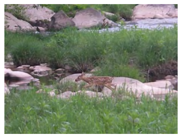
A very young fawn crosses the Schoharie Creek, summer 2006.

The Schoharie watershed is literally crawling with life. An amazing variety of habitats, people, plants, and animals are all interconnected in a fragile web of life, often called biodiversity. Every member is essential to keeping this web in balance. For example, the list of species required for the life cycle of a single tree may be in the hundreds or thousands. Moreover, the list of animals that will utilize a single fallen tree is