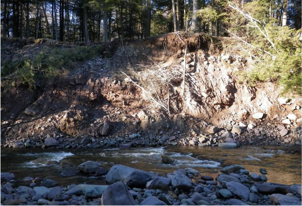
Slope failure on the right bank. (IMG1565)

This failure has become more severe as a result of the additional hydraulic erosion during recent high flow events, suggesting that it will continue to erode and fail during significant flood events. Therefore, full restoration is recommended for this site in order to alleviate hydraulic pressure on the bank and improve bank stability. This restoration effort could include installation of a bankfull stage bench at the toe of the slope, an increased radius of curvature, and removal of mature trees at the top of the bank that could fall and obstruct flow in the main channel. Furthermore, both in-stream structures like rock vanes and the use of bioengineering techniques to vegetate the exposed slope could help reduce erosive forces on the bank during high flow events.