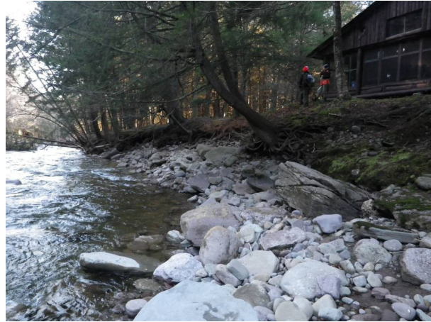
Eroding bank segment on the right bank. Note newly formed cobble bankfull stage bench at the toe of the slope. (IMGP1555)

Subsequent flooding has led to several channel adjustments in this reach, including removal of a side bar across from this eroding bank segment and formation of a depositional bench at the toe of undercut bank. This bench should prevent further undercutting during high flow events, and it is likely that it will self-vegetate. This vegetation could further reduce the erosive forces on this stream bank during future high flow events. Therefore, it is possible for this bank to stabilize without treatment ( passive restoration ). It is recommended that this site be monitored for changes in condition.