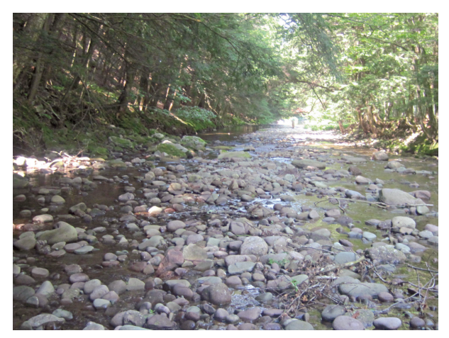
Transverse bar (A18)

Slightly downstream, near Station 32300 the High Falls Brook tributary joins the main channel from the right bank conveying drainage from the north side of High Falls Ridge. Old mortar abutments were observed on both bank of High Falls Brook at the convergence. It is possible that these mortar abutments