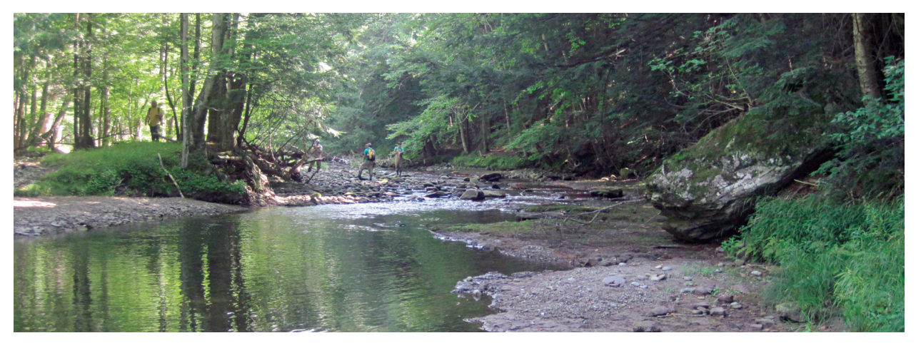
Shale bedrock providing grade control on left bed (A16)

revetment was documented in fair structural and functional condition. The erosion into the toe of the failed erosion was documented as active caused by hydraulic erosion (BEMS NWB9_33600). Review of the aerial imagery available for this bank reveals several garages and equipment staging areas on the right bank behind this bank failure site; the revetment was most likely designed to stabilize the bank and protect this property. (IMGP0286)