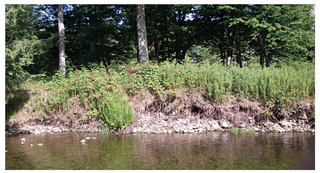
Active hydraulic erosion of bank (IMPG0276)

An eroding bank segment was observed extending 300 feet from Station 34275 to Station 33975 (BEMS NWB9_33975). This site was documented as active; hydraulic erosion during high flow events has led to exposure of alluvial materials in the bank, although some vegetation was observed on the bank in conjunction with hardening at the toe. (IMPG0276) It is likely that this bank will revegetate and stabilize without treatment ( passive restoration ). However, it is recommended that this site be monitored for changes in condition.