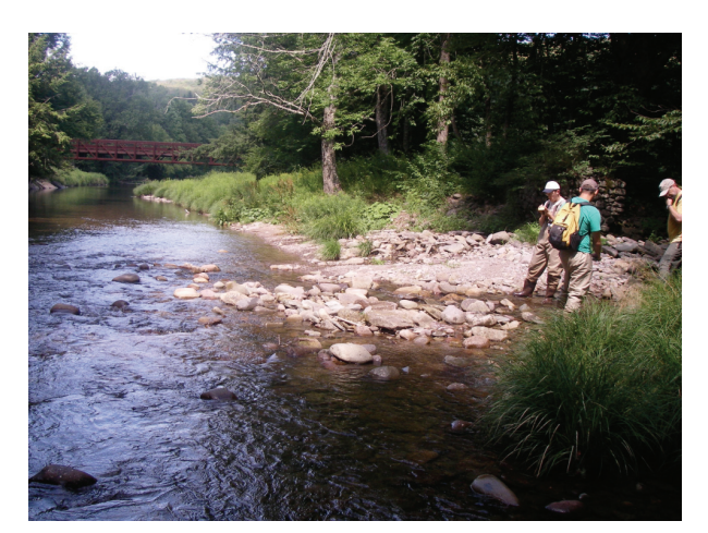
High Falls Brook confluence (IMPG0302)