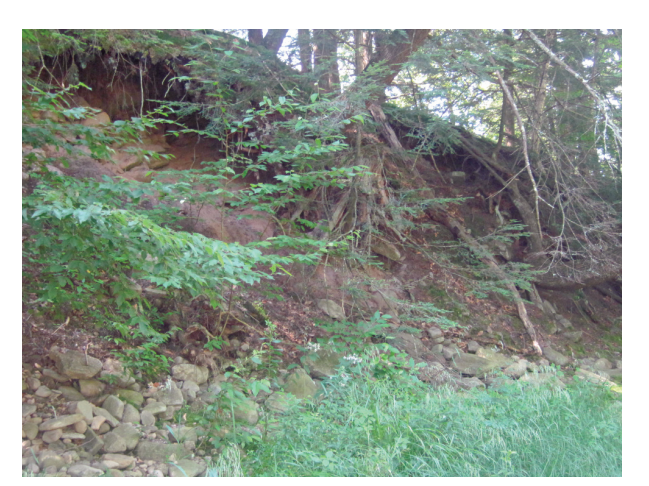
Eroding left bank (A23)

are remnants from the sawmill formerly located on High Falls Brook upstream of the confluence. (IMGP0302) A headcut was observed in the main channel slightly upstream of the private bridge.