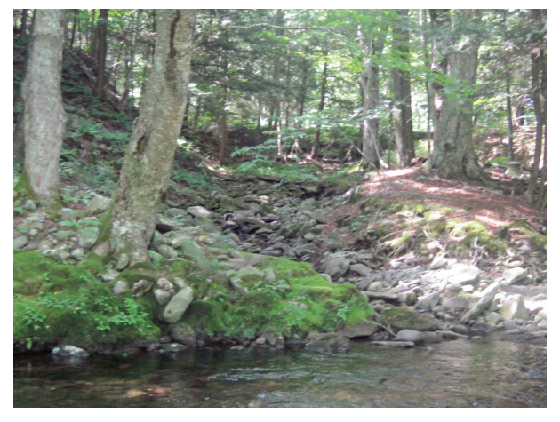
Intermittent tributary conveying concentrated runoff (A22)