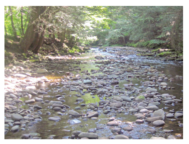
Transverse bar (A20)