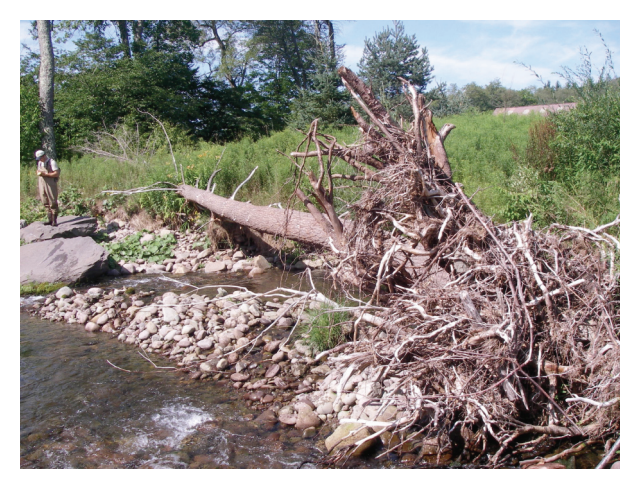
Perennial stream conveying flow around large obstruction (IMPG0281)