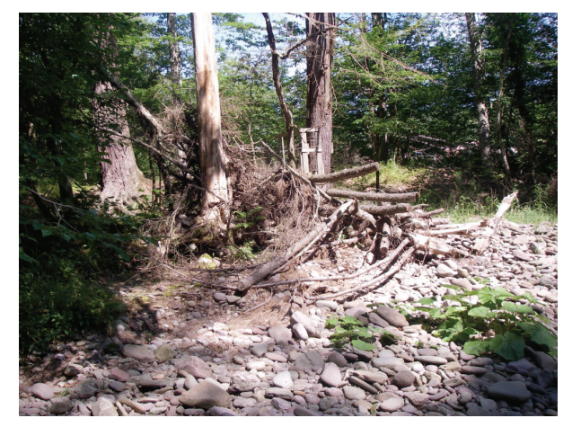
Woody debris jam forming on right bank (IMPG0295)

Recommendations for this site include investigation of past management activities and potentially full restoration . This project would require geomorphic and sediment transport