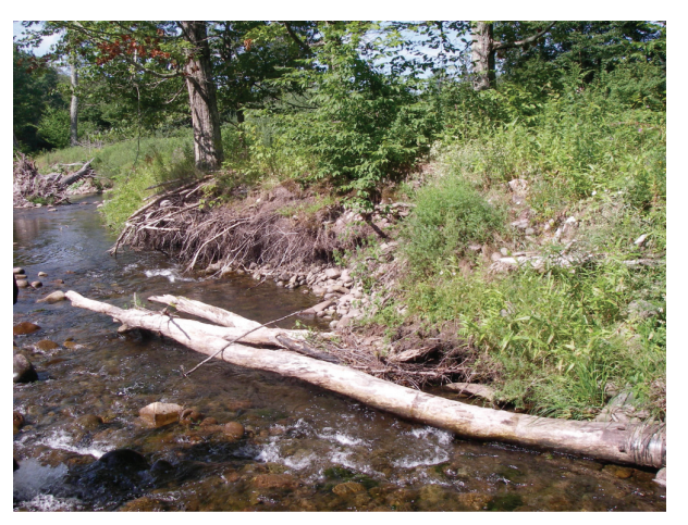
Fallen trees along right bank (IMPG0277)