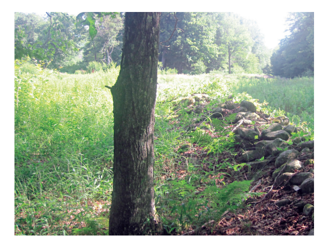
Stacked stone berm on left bed (A7)