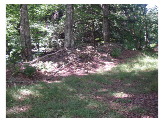
Stacked stone berm perpendicular to stream (IMPG0300)