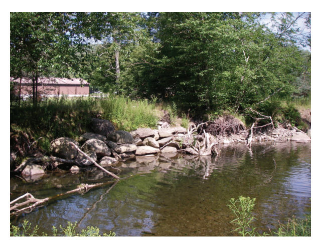
Stacked rock revetment (IMPG0286)

A depositional feature was observed on the left bed in this location composed of cobble with some grass and sedge vegetation. On the left bank behind this cobble bar a 4-foot high and 4-foot wide stacked stone berm was observed extending 85 feet between Station 34300 and Station 34215. It appeared that the berm was constructed to block a currently dry side channel that flows adjacent to the left valley wall as the main channel curves slightly right towards Frost Valley Road. This channel converges with the main channel at the end of the meander near Station 33500. The 1980 stream center line shows this dry side channel as conveying the majority of the flow historically. (A7)