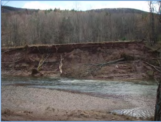
Holden Stream Restoration Project Before and After