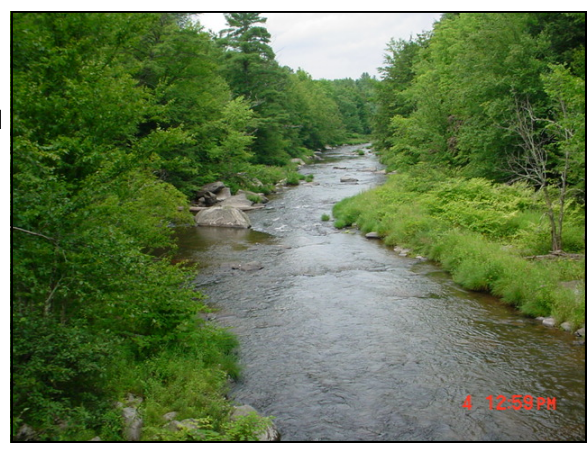
An effective riparian buffer zone (above) will have a variety of deep rooted woody trees and shrubs as well as herbaceous plants growing in various zones of the stream corridor, while a riparian buffer zone in poor condition (below) often does not contain the deeper rooted woody plants that are essential for bank stability.

Programmatic Resources - development of task force for review of stream disturbance permit applications; development of guidelines which integrates stream form and function for use during periods of flood response; and evaluation of municipalities existing land use regulations and adoption of stream corridor protection provisions.