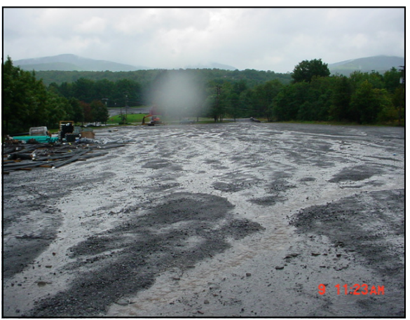
The GCSWCD is working with Windham Mountain to retrofit older development features such as this parking lot to address stormwater quality. Note the extensive rill erosion and loss of sediments.