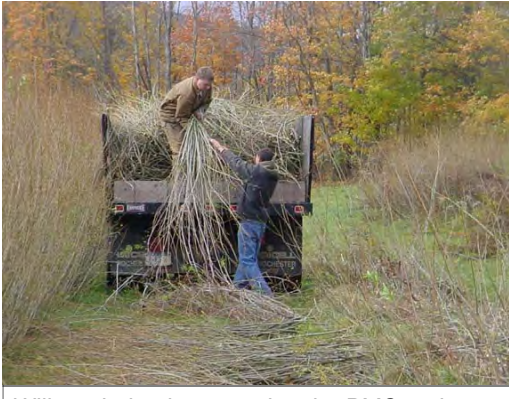
Willows being harvested at the PMC; to be used for willow fascines.

Vegetation plays a crucial role in restoration projects. The roots of grasses, trees, and shrubs protrude into the ground creating the intricate framework that binds soil throughout the project site and provides resistance against runoff and flowing water.