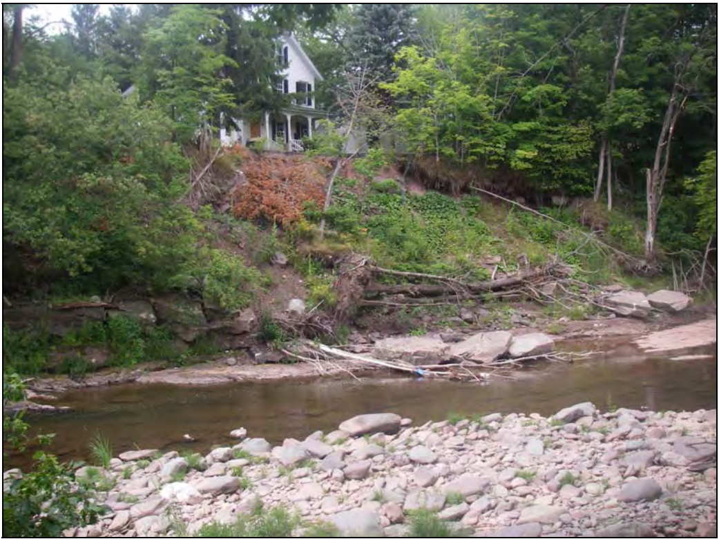
Figure 4 - Fractured bed rock at the toe of the bank failure

While the channel bed and lower banks were comprised of various types of bedrock, the upper slope contained much finer grained materials that were much more prone to failure.