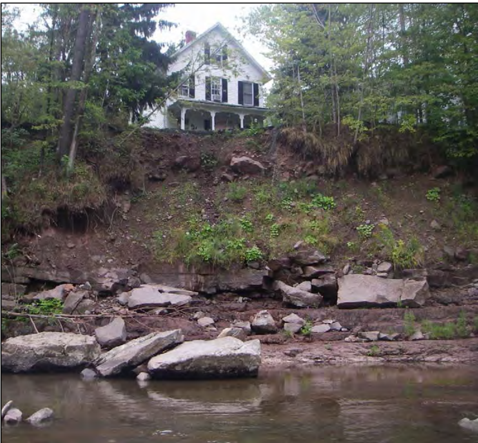
Existing Site Conditions

Construction is expected to begin in June of 2008 and persist for approximately 4 weeks. Construction of the newly shaped stream embankment will include installation of terraced rock walls to achieve stable bank geometry. and vegetative applications to improve the ecological value of the treatment.