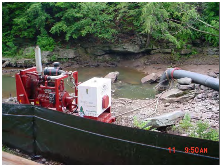
Figure 7 - Dewatering equipment Installed on Site

Sediment control during construction was accomplished through collection of all turbid water within the work area, and pumping the sediment-laden water to designated filter areas. The Contractor was also required to develop open sediment basins constructed of hay bales lined with filter fabric to achieve acceptable sediment control. The constructed basins were placed near the locations of the existing filter areas and pre-treated the discharge before it was released to the stream channel. All disturbed areas were stabilized as soon as possible to minimize soil erosion.