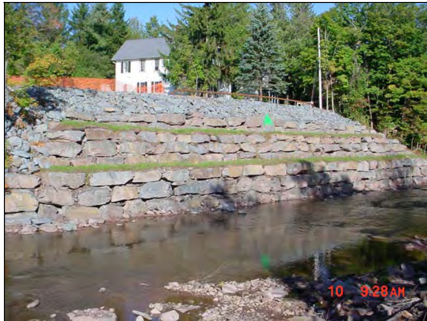
Figure 6 - Completed Embankment Repair

The overall retaining structure that was designed to stabilize the embankment met several design guidelines. First, the geometry of the wall needed to result in an overall bank slope of 1:1 or flatter. Second, the wall needed to be designed with terraces so vegetation could be incorporated into the wall. Third, the wall needed to allow reconstruction of Schoharie Street in its original location. Fourth, the wall needed to tie into the bank toe in a location that would minimize its impact on the channel morphology of the Schoharie Creek. And Finally, the individual stone walls that formed each terrace needed to have a slope that did not exceed 1 horizontal : 6 vertical.