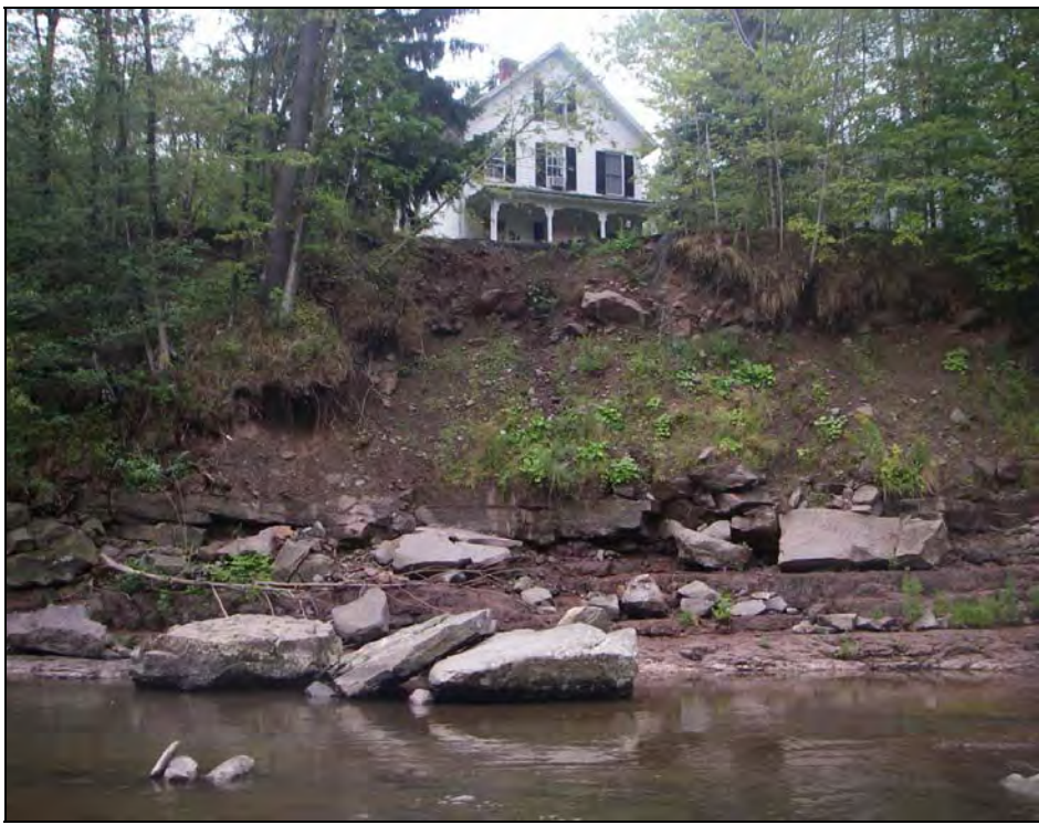
Figure 1 - Bank Failure at Schoharie Street Project Site

The New York City Department of Environmental Protection (NYCDEP) initiated a regional study of water quality in the spring of 1993. The study focused on sub-basins in the West of Hudson (WOH) watershed and included identifying areas of concern and developing a comprehensive understanding of the sources and fate of materials contributing to turbidity and total suspended solids (TSS). In 2006, a watershed management project was initiated between the NYCDEP and the Greene County Soil and Water Conservation District (GCSWCD) in the Schoharie watershed. The Schoharie Stream Management Project focused on using fluvial geomorphic-based stream classification, assessment and restoration principles in an attempt to reduce turbidity and TSS loading in the watershed.