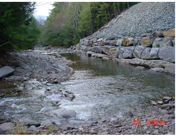
Rockery Wall on Gooseberry Creek.

Upon completion of the embankment stabilization, the damaged portion of Schoharie Avenue will be resurfaced and made available for use.