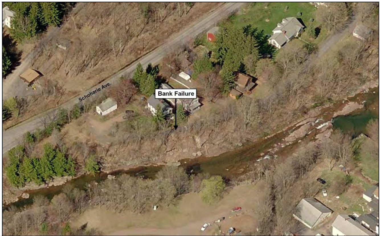
Figure 2 - 2006 aerial photograph of bank failure at Schoharie Street Stabilization Project

In 1885, the Catskill and Adirondack Forest Preserve was established by the NY State Assembly. An 1894 amendment to the New York State Constitution (now Article 14) directs: "the lands of the State now owned or hereafter acquired, constituting the forest preserve as now fixed by law, shall be forever kept as wild forest lands. They shall not be leased, sold or exchanged, or be taken by any corporation, public or private, nor shall the timber thereon be sold, removed or destroyed."