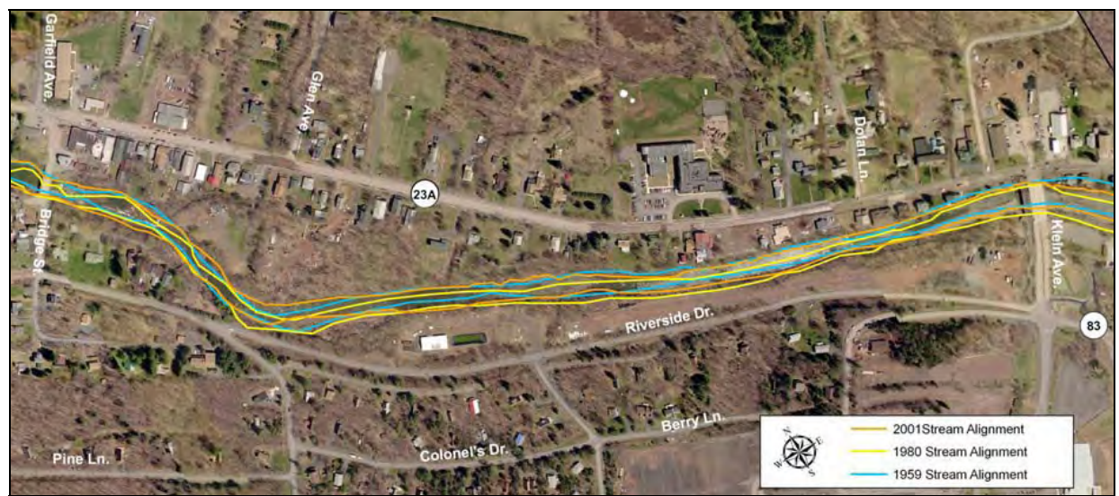
Figure 3 - Historic channel alignments for Schoharie Creek in the Village of Hunter

Historic aerials from 1959, 1980 and 2001 were assessed to observe physical conditions of the reach including response and patterns in planform adjustment and trends in stream morphology. As seen from the historical stream alignments (below), the planform of the channel has remained fairly stable since 1959.