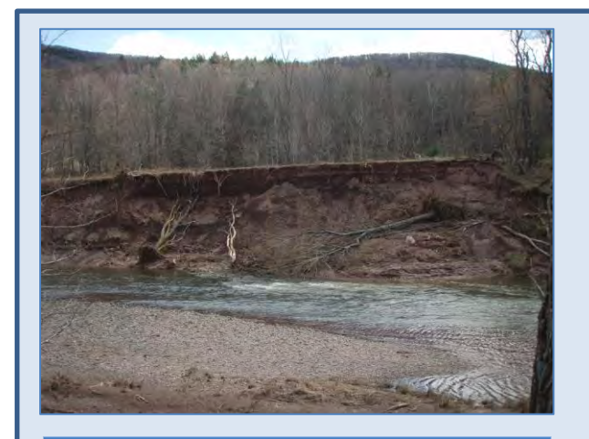
Holden Stream Restoration Project Before and After