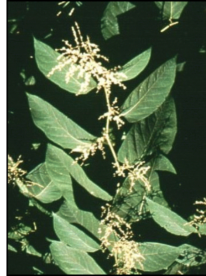
Figure IV-34: Japanese Knotweed has distinctive broad leaves, large hollow stems and small white flowers in the fall.

Compounding the problems of poor rooting depth and aggressive growth, Japanese Knotweed is also very difficult to eradicate. Various methods from mechanical removal to herbicide application have been used to control knotweed with limited success. Generally, eradication requires multiple year treatments with herbicides and mechanical treatments such as excavation or mowing. During Phase II of the Project, the GCSWCD and NYCDEP will be working with Hudsonia to investigate the knotweed situation and to use field trials to test different management techniques. Hudsonia is a non-advocacy, nonprofit, scientific research and education institute located in Annandale, NY (Hudsonia 2001).