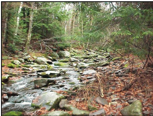
Figure IV-30: Riparian buffers provided stability, habitat and cooling benefits along the stream corridor.

In some studies, it has been reported that effective riparian buffers may reduce as much as 50% of nutrients entering the stream (Fischenich et al 2000). In some cases pollutants such as sediments may experience reductions up to 90% as the suspended soil particles are trapped in the buffer. The effectiveness of a riparian buffer in the removal of pollutants is influenced by the width of the buffer, as well as density and types of plants present.