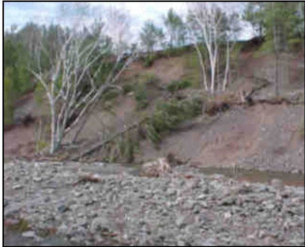
Figure IV-32: Under conditions of extreme stream instability, riparian vegetation can be ineffective in providing streambank stability as shown in this eroded terrace in Big Hollow.

In the middle watershed, or that reach from Greene County Route 67 in Hensonville to the South Street bridge, the riparian condition is highly variable. Some sections are characterized by an effective buffer on both sides of the stream and other sections are highly deficient in riparian structure. In the stream reach from Greene County Route 67 to the State Route 296 bridge, instability of the stream system has exceeded the ability of the riparian buffer to prevent streambank erosion ( Figure IV-32 ), and significant areas of mature buffer have been damaged or lost. Channel migration in this reach has resulted in over-widening of the stream and loss of riparian function.