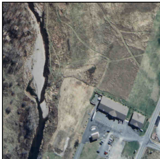
Figure IV-31: This reach behind Alpine Village complex exhibits poor riparian conditions and is highly unstable

During the course of Phase I of the Batavia Kill Pilot Project, riparian buffer mapping and detailed riparian assessments were not conducted. The GCSWCD is currently mapping the riparian condition, as well as identifying areas containing Japanese knotweed. The Batavia Kill watershed does exhibit some general trends in riparian vegetation based on the location of the watershed. Steeper headwater reaches are typically well vegetated, with much less healthy buffers present lower in the watershed. In the following sections, the watershed has been divided into three general zones based on broad similarities in the riparian conditions. Vegetation is addressed in greater detail later in this document.