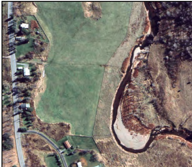
Figure IV-33: In this field in Ashland behind Carrington Road, note the absence of riparian vegetation along the fields. The GCSWCD has measured migrations of this meander bend of over 40 feet in a single storm event.

In this reach, agricultural operations, road construction, and other human activities as well as stream instability processes have significantly degraded the riparian zone and there are numerous areas where streambank erosion and lack of shade cover are impacting the stream. Ironically, in this section of the Batavia Kill stream system, the presence of loose, unconsolidated alluvial soils and “C” type streams makes the presence of vegetation critical to long-term stream stability.