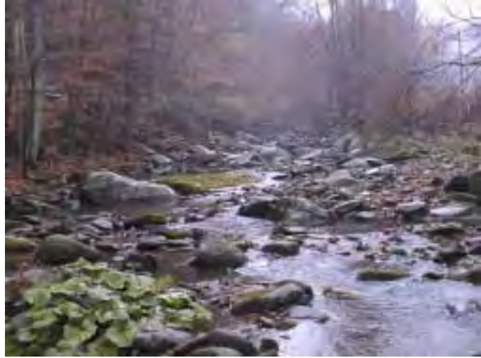
Photo 1. Looking upstream near the top of MU2, road at left at the top of the bank

Management Unit 2 (MU2) is located in Greene County, NY 1&2 . The top of MU2 begins at a section of failing log crib wall where the road begins to run very close to the stream, approximately 2,400 feet from the top of Broadstreet Hollow Road (Photos 1 and 2). The Unit extends downstream approximately 1,480 feet to the outlet of the new County Bridge just below where Regina's Way intersects Broadstreet Hollow Road.