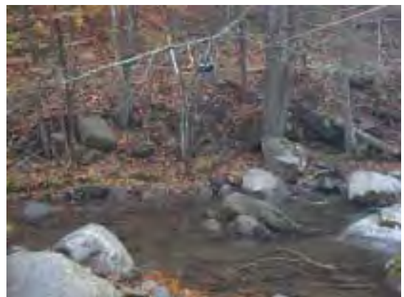
Photo 14. Eroding right bank at Broadstreet Hollow Road, monitoring cross-section 28 (flow from right to left).