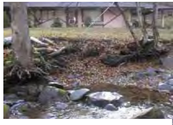
Photo 9. Eroding left bank at residential lawn, monitoring cross-section 23 (flow from left to right).