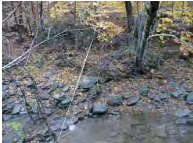
Photo 15. Berm on the left bank (in the middle of the photo), at monitoring cross-section 22 location (flow from left to right).

The berm on the left bank in this reach appears to be material pushed into that area in response to flood damages in the vicinity of the bridge just downstream (County Bridge just below Regina's Way intersection) (Photo 15) 3 . This practice of "cleaning" the gravel out of a stream in this way is thought to increase flood capacity by creating a larger stream channel. Unfortunately, berms such as these generally do not offer any protection from flooding, and can cause stream entrenchment and higher flood stage locally by preventing floodwaters from flowing over the floodplain, cutting off an important function of these flat areas.