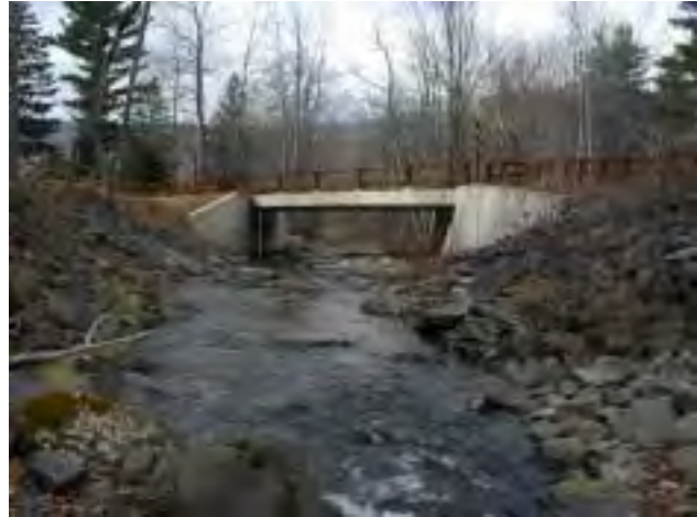
Photo 3. Looking upstream at bridge on Broadstreet Hollow Road, just below Regina's Way intersection (BIN 3201230).

The upper section of Broadstreet Hollow Road at the top of MU2 is packed dirt for approximately the first 480 feet, changing to oil and crushed stone for approximately 660 feet before becoming paved. Stream assessment data for 2001 shows the road centerline ranging from 1 to approximately 90 feet from the stream (measured from the thalweg , or the deepest part of the stream).