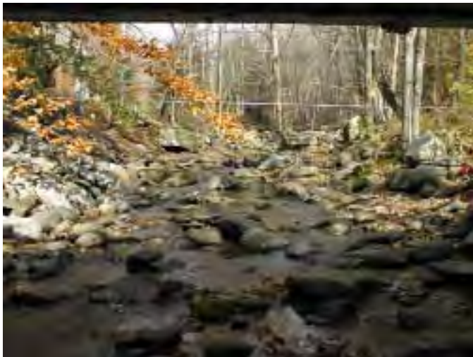
Photo 2. Looking upstream from bridge in the middle of MU2, road at left at the top of the bank

The stream in this unit runs close to the road for most of its length, and has three bridges (two private and one County maintained). MU2 is a largely unstable reach that is in poor condition. This is primarily attributed to the proximity to the road, as well as existing berms and stream bank conditions. This unit has several long eroding banks and hundreds of feet of stream bank stabilization measures, or revetments 3 . Though not extensive, glacial lake clay exposures in the stream bed and banks in this unit could worsen stream instability or add to water quality problems 10 . Stream assessment done in 2001 documented both the largest stand of the invasive plant, Japanese Knotweed , in the entire valley, as well as the most extensive stream-side dumping site 7 .