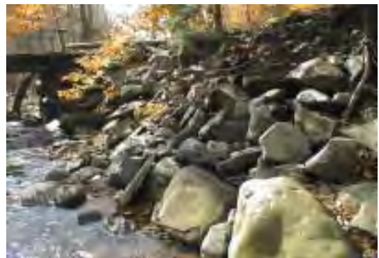
Photo 6. Dumped rock fill upstream of Shinbach's bridge, right bank.