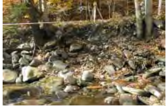
Photo 11. Eroding right bank at Broadstreet Hollow Road, monitoring cross-section 25 (flow from right to left).