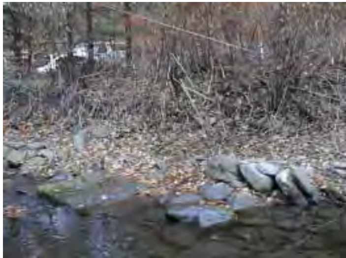
Photo 16. Japanese Knotweed, winter dormant state, right bank at monitoring cross-section 27 (flow from right to left).

Japanese Knotweed, a non-native, invasive plant, was documented on 95 feet (3%) of the banks in this unit during stream assessment in 2001 (Photo 16). This species is an invasive exotic, and damaging to riparian integrity 7 . Japanese Knotweed is fast growing, can crowd out native vegetation and the roots provide little or no soil-anchoring action.