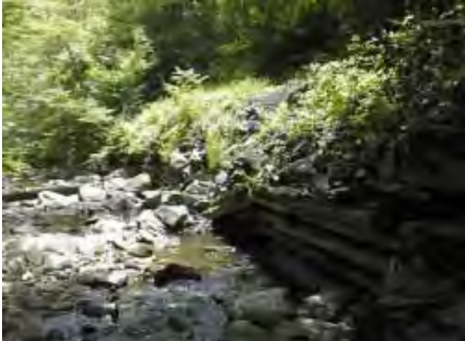
Photo 7. Failing log crib wall, with dumped rock fill, at the top of MU2.

Broadstreet Hollow stream can transport very large rocks, or sediment , along the stream bed (sediment in transport is called bedload ). The size of sediment in dumped rock fill is often smaller than the bedload. As a result, rocks on the bank continue to wash downstream over time, needing periodic replacement. Continuing disturbance of the bank area prevents streamside, or riparian , trees and other vegetation from becoming established 7 . Further, some riparian tree species become stressed and weakened when their