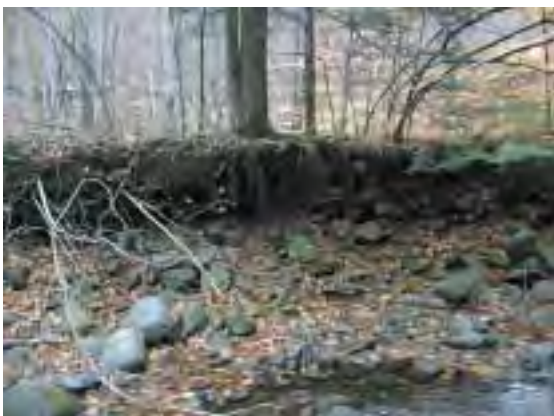
Photo 13. Eroding left bank at forested floodplain, opposite berm and fill area, monitoring cross-section 27 (flow from left to right).

An old dumping site (see Photo 12) was found in this reach which has exposed the bank and has triggered ongoing bank erosion. This site poses a safety hazard from metal degradation of old concrete slab revetment and glass refuse material, in addition to the aesthetic and property value issues resulting from a dumping site.