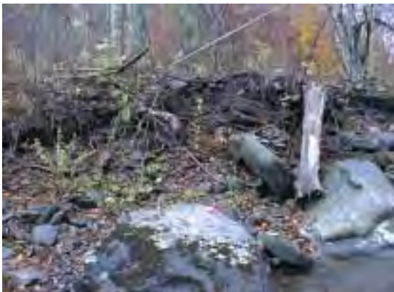
Photo 8. Eroding right bank at Broadstreet Hollow Road fill area, monitoring cross-section 22 (flow from right to left).

Stream assessment conducted in 2001 showed approximately 505 feet (17%) of eroding stream bank in MU2, in seven sections (Photos 8 - 14). All seven sections have been monumented at a representative location for future monitoring (locations designated as “monitoring cross-sections”) to determine erosion rates and priority for potential restoration 3 . These sites have been assessed and ranked based on calculation of a Bank Erodibility Hazard Index (BEHI) using data collected at the time of the stream assessment survey in 2001 4 .