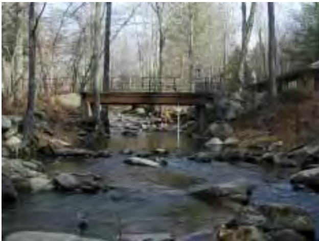
Photo 4. Looking upstream at private crossing.

One County maintained bridge crosses the stream in MU2 on Broadstreet Hollow Road, just below the intersection with Regina's Way (Photo 3). This bridge was replaced following the flood of 1996, and is wide enough to accommodate both a low flow stream channel and to allow the stream to maintain a generally natural shape consistent with dimensions upstream and downstream.