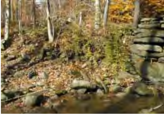
Photo 10. Eroding right bank at Broadstreet Hollow Road, and private bridge outlet, monitoring cross-section 24 (flow from right to left).

Four of the seven eroding banks are associated with road fill areas (see Photos 8, 10,11 and 14); one of these is also associated with eddy erosion at the outlet of the private bridge (see Photo 10). The bank at monitoring cross section 23 is associated with both a residential lawn area and the private bridge approach (see Photo 9).