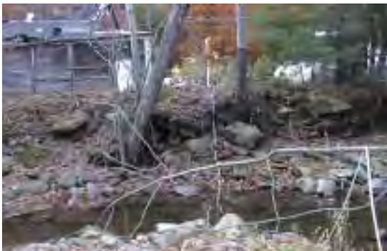
Photo 12. Eroding right bank at deteriorated house and dumping site, monitoring cross-section 26 (flow from right to left).

An old dumping site (see Photo 12) was found in this reach which has exposed the bank and has triggered ongoing bank erosion. This site poses a safety hazard from metal degradation of old concrete slab revetment and glass refuse material, in addition to the aesthetic and property value issues resulting from a dumping site.