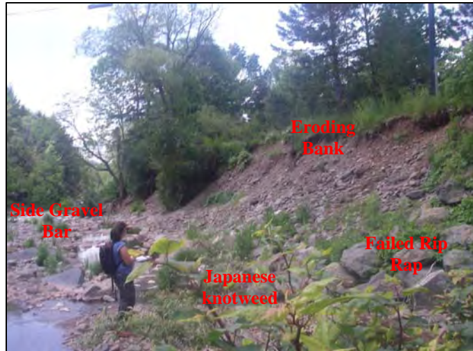
Schoharie/East Kill Project Team Member assesses a stretch of Schoharie Creek as part of 2006 walkover.

This stream feature inventory was also used to help define and prioritize further assessment, and scope the issues to be addressed in the management plan. Most of the data presented in the Management Unit Descriptions in Section 4 was derived from the stream feature inventory walkover conducted during the Summer of 2006. The Trimble GeoXH Global Positioning System (GPS) was used to map locations of features described above. Photographs and attribute data were also taken at each feature. Protocol used for attribute collection is detailed in Appendix F, Stream Management Data Dictionary Guide.