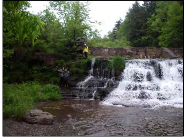
Schoharie/East Kill project team near a dam in the upper Schoharie

A watershed assessment protocol was prepared to support the development of the Schoharie and East Kill Stream Management Plans. The protocol was meant to provide the project team with a general baseline inventory of conditions throughout the stream corridor.