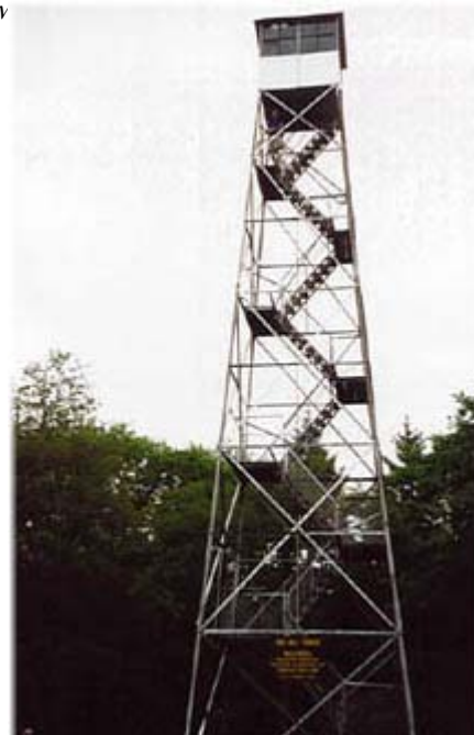
Photo X. The renovated Red Hill Tower that stands 60' above the forest floor.

Red Hill Fire Tower (easy) - A 1.35-mile hike through a pleasant forest, uphill but not too steep, leads