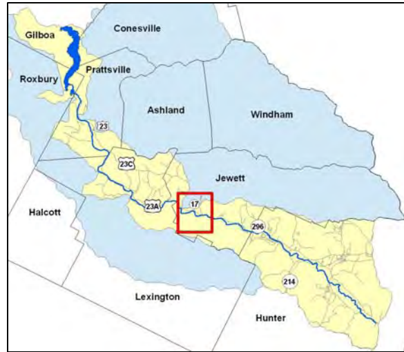
Management Unit 9 location see Figure 4.0.1 for more detailed map