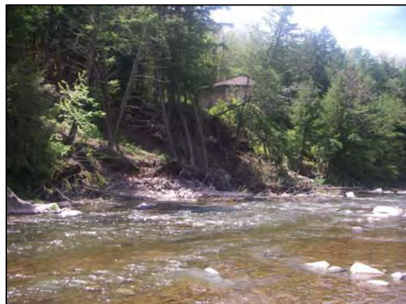
Bank erosion at 78900

Along the outside meander of this bend the thalweg , or deepest part of the stream channel, flowed up against the left streambank causing significant bank erosion (Station 78900). Streambank erosion often occurs on the outside of meander bends where the stream velocity is greatest during high flows. A 19,823ft 2 area of streambank had been left unvegetated, exposing a glacial lake silt/clay deposit. Fine sediment inputs from eroding bank can be a water quality concern because they increase turbidity and can act as a transport mechanism for other pollutants and pathogens. Sheet piling had