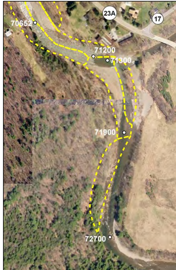
Wetlands at downstream end of management unit Approximate wetland boundary delineated by NWI

At the downstream end of this management unit the East Kill entered the Schoharie Creek from the right streambank (Inset A, Station 71400). The East Kill flows from its headwaters upstream of Lake Capra (upstream of Colgate Lake) through the town of Jewett, roughly following County Route 23C, to its confluence with the Schoharie Creek. Its watershed drains approximately 37 mi 2 and is closely surrounded by the steep mountains of the Catskills, specifically the Blackheads. As evidenced by the large amount of deposition upstream and downstream of the confluence, the East Kill delivers a significant amount of sediment into the Schoharie Creek. The East Kill is classified as C(t) by NYSDEC (NYSDEC, 1994).