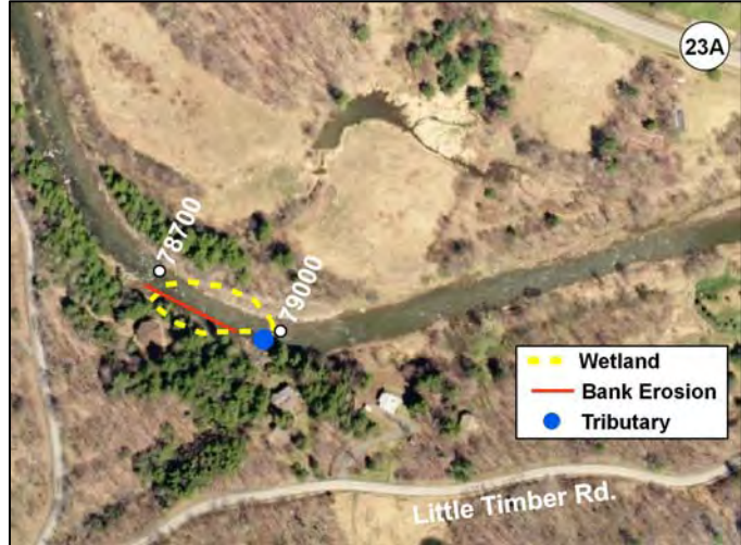
Wetland (Station 79000-78700) Approximate wetland boundary delineated by NWI

As the stream meandered downstream a 0.5 acre riverine, upper perennial, seasonally flooded wetland was located within the stream channel (R2USC, Station 79000-78700). Near the upstream end of this wetland an unnamed tributary entered the Schoharie Creek from the left streambank (Station 78965). This tributary drained the steep slopes of Evergreen Mountain, before it reached the flatter topography of the valley floor where it entered the Schoharie Creek. As a result of this stream slope change, the tributary lost its ability to transport sediment gathered from the mountain slopes, and began to deposit sediment at its mouth and into the more gently sloped Schoharie Creek. This is a common feature of confluence areas, which often contain extensive sediment bars, function as important sediment storage areas, and are typically among the most dynamic and changeable areas in the stream system. This tributary was classified C by the NYSDEC (NYSDEC, 1994).