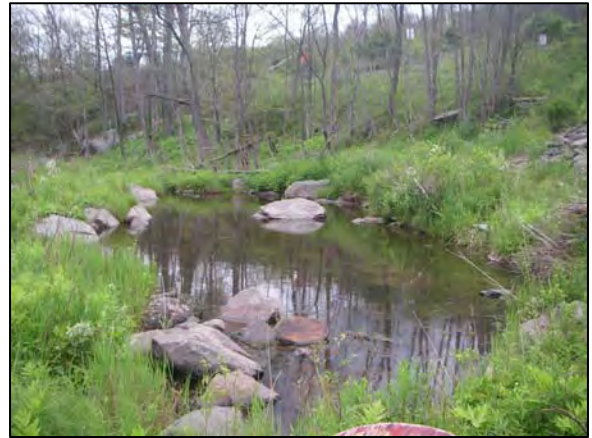
Detention basin at Station 76700

At the next downstream meander bend, the stream was once again pushed against the County Route 23A embankment. Rip-rap had been installed along 312ft of this embankment and was in good structural condition with shrub and herbaceous vegetation growing throughout (Inset B, Station 76900). Several hillside seeps, along with road drainage, entered Schoharie Creek along this bank. A small detention pond designed to retain stormwater runoff, and remove sediment within the stormwater by settling, had been installed on the streambank terrace (Station 76700).