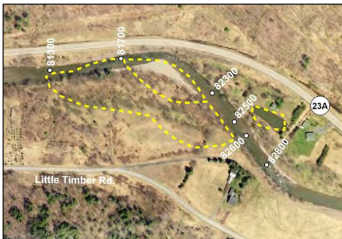
Wetlands (Station 82800-82500 & 82600-81300 & 82300-81700) Approximate wetland boundary delineated by NWI

Just downstream, a 174ft long stacked rock wall had been built along the left streambank perhaps intended to protect the adjacent land from flooding (Station 82830). The building of walls or berms within the floodplain is not recommended as it may act to raise flood elevations and increase the erosive power of the stream. They should be evaluated for their influence on floodplain connectivity and stream entrenchment, and removal should be considered where a significant negative impact is found.