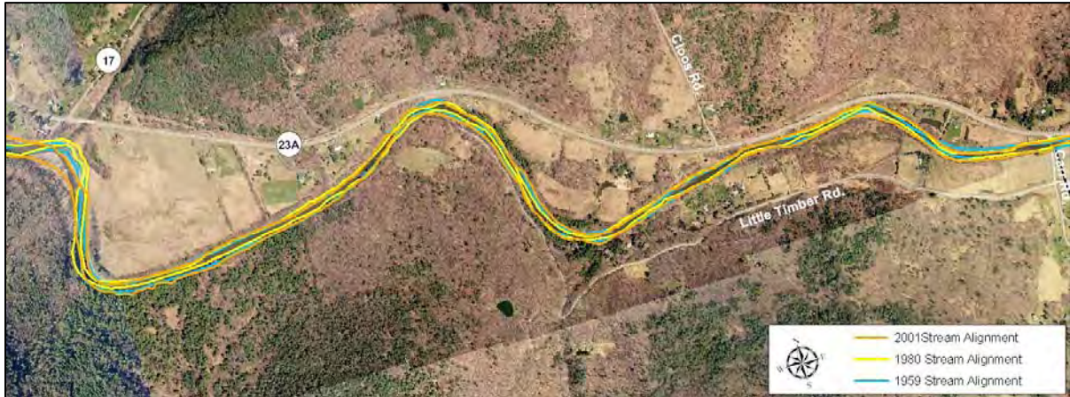
Historic stream channel alignments overlaid with 2006 aerial photograph

As seen from the historical stream alignments (below), the planform of the channel has remained fairly stable since 1959.