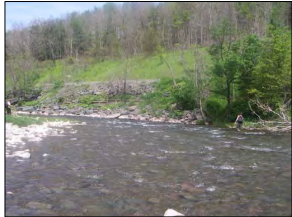
Revetment at Station 82300

As the stream flowed directly towards the County Route 23A embankment, revetment including 767ft of rip-rap and 90ft of T-wall had been installed along the right streambank (Station 82300). Interplanting of the existing rip-rap, by inserting plantings into the soil between the rocks may help to strengthen and increase the longevity of this rip-rap. These plantings will also improve the aquatic habitat by providing shade, resulting in cooler water temperatures.