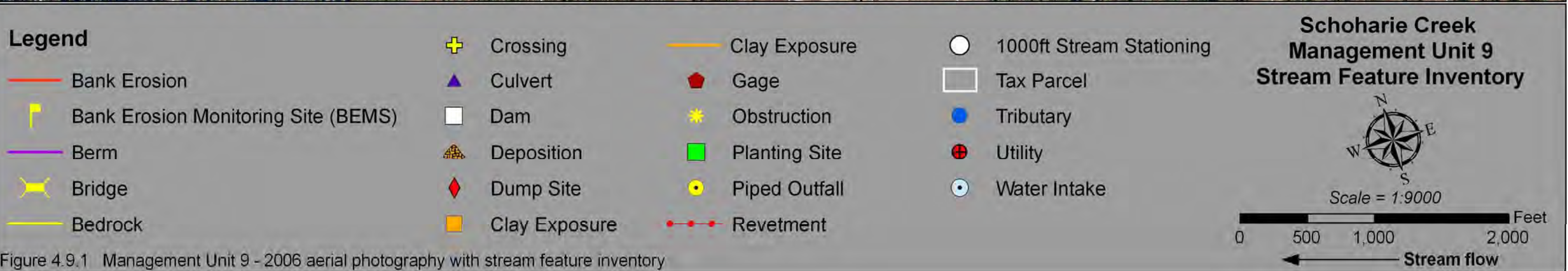
Figure 4.9.1 Management Unit 9 - 2006 aerial photography with stream feature inventory