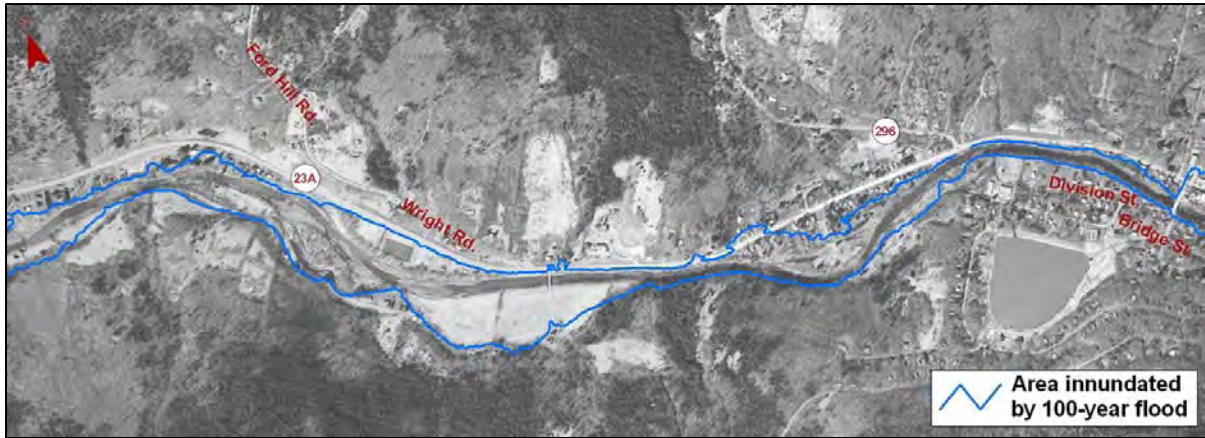
100-year floodplain boundary map