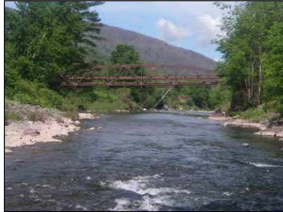
Bridge at Carr Road (Station 83957)

This management unit began as the stream passed under the Carr Road bridge. While bankfull flows appeared to flow freely through this bridge, higher flows overtop the bridge and flow over Carr Road rendering the bridge impassable. This bridge is the sole access residents have to cross the Schoharie Creek and during floods residents are cut off from emergency services. Repeated repair of Carr Road after