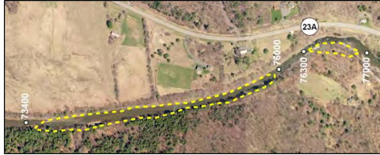
Wetland (Station 7700-76300 & 76000-73400) Approximate wetland boundary delineated by NWI

There was a 0.9 acre riverine, upper perennial, seasonally flooded wetland located along the left streambank (R2USC, Station 77000-76300). A larger 5.4 acre riverine, upper perennial, permanently flood wetland was located within the stream channel downstream (R2UBH, Station 76000-73400).