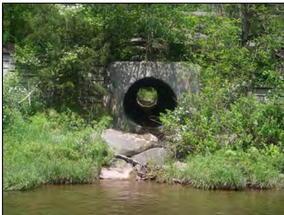
Culvert and Tributary at Station 80800

The downstream County Route 23A embankment had again been stabilized with 414ft of rip-rap and 175ft of T-wall along the right streambank (Inset C, Station 81050). Native vegetation including mature trees and shrubs had grown along this revetment,