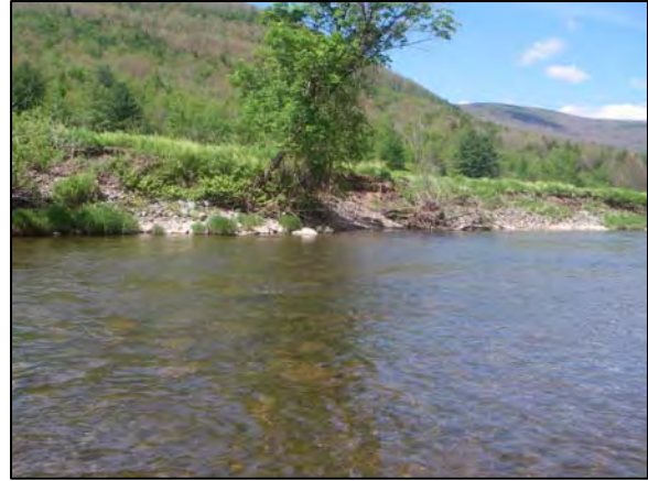
Bank erosion at Station 83400

Downstream, approximately 276ft of the left streambank had suffered minor erosion during high flow events (Station 83400). A piped outfall, which discharged stormwater from Little Timber Road onto this streambank, may exacerbate erosion at this site. The stability of this streambank could be improved with plantings of willow fascines and sedges along the toe of the bank coupled with trees and shrubs along the bank. These plantings would also improve the aquatic habitat within this reach. Erosion continued downstream for 331ft of the left streambank (Station 82830). This site was also a good candidate for bioengineering stabilization techniques.