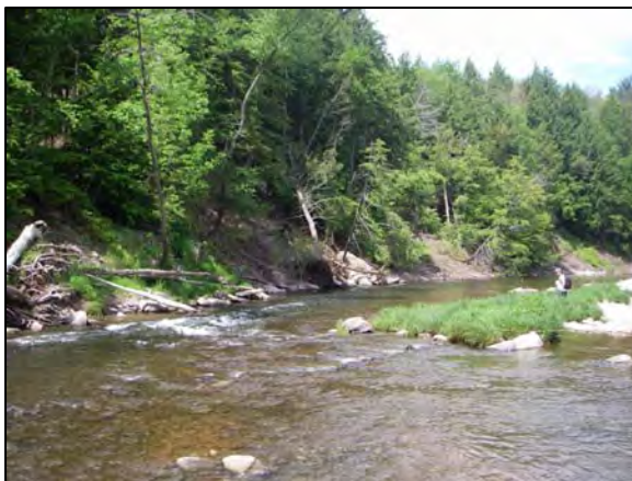
Bank erosion at Station 73100

Another small dump site containing old cars and metal debris was documented on the right streambank (Station 73750). Removal of this dump is recommended in order to protect the stream.