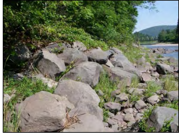
Rip-rap at Station 12100

Beginning at Station 12100 downstream to the NYS Route 23 bridge in Prattsville, rip-rap had been installed along 1,035 ft of the County Route 2 road embankment on the left streambank. While some vegetation was established above this rip-rap, additional plantings of native trees and shrubs is recommended at this site. Plantings of shrubs and sedges along the toe of the bank may also provide additional protection against erosion.