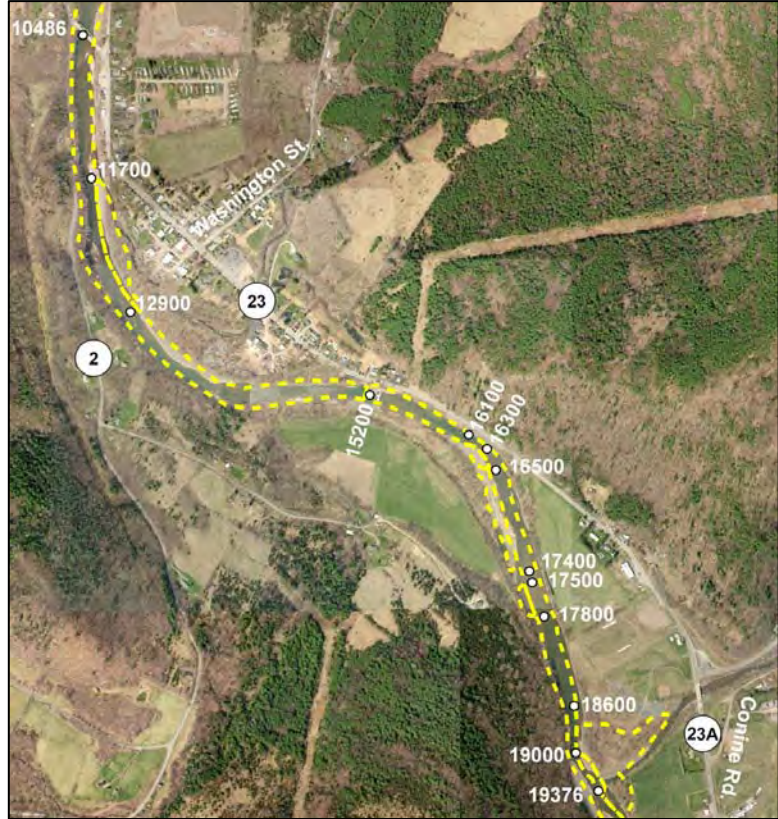
Wetlands (Station 19376-10486) approximate wetland boundary delineated by NWI

perennial wetlands, signifying they were contained in the natural channel and characterized by a low gradient and slow water velocity (R2UBH, 11.6ac Station 19376-15200) (R2USC, 0.6ac, Station 19376-19000) (R2USC, 0.4ac, Station 16500-16100). Three wetlands were all classified as palustrine wetlands; one was dominated by forest vegetation (PFO1A, 5.1ac, Station 19376-18600), and two had shrub-scrub vegetation (PSS1C, 0.4ac, Station 17800-17500) (PSS1C, 1.6ac, Station 17400-16300). Two wetlands including the entire stream channel along the downstream half of this unit were classified as lacustrine wetlands (L1UBHh, 18.2ac Station 15200-10486) (L2USAh, 2.8ac, Station 12900-11700). Wetlands are important features in the landscape that provide numerous beneficial functions including protecting and improving water quality, providing fish and wildlife habitats, storing floodwaters, and maintaining surface water flow during dry periods (see Section 2.6 for detailed wetland type descriptions).