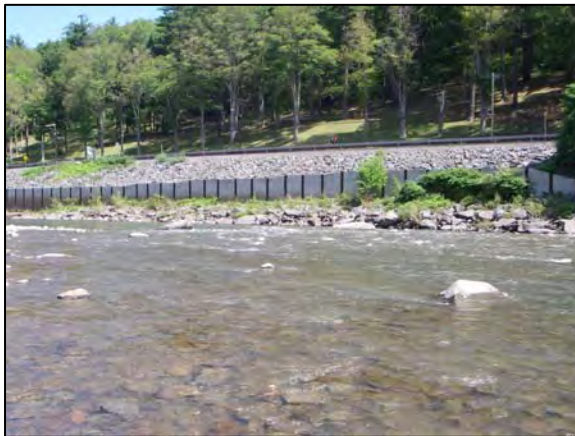
Revetment at Station 16400

Downstream, similar scour had occurred along 414 ft of the left streambank (Inset D, Station 17850), exposing a 45 ft 2 clay/silt deposit. Fine sediment inputs from eroding banks can be a water quality concern because they increase turbidity and can act as a transport mechanism for other pollutants and pathogens. On the opposite bank (right) a dump site including an old car and other metal debris was documented (Station 17730). To prevent introduction of this material and any associated pollutants into the stream, the dump should be removed.