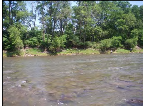
Bank erosion at Station 14400

On the opposite bank 434 ft (Station 14400) had scoured during high flow events. This type of erosion is common and part of natural stream process. In stable watersheds, the rate of erosion is slow and a natural healing process usually follows. The stability of this streambank might be improved with plantings of willow fascines and sedges.