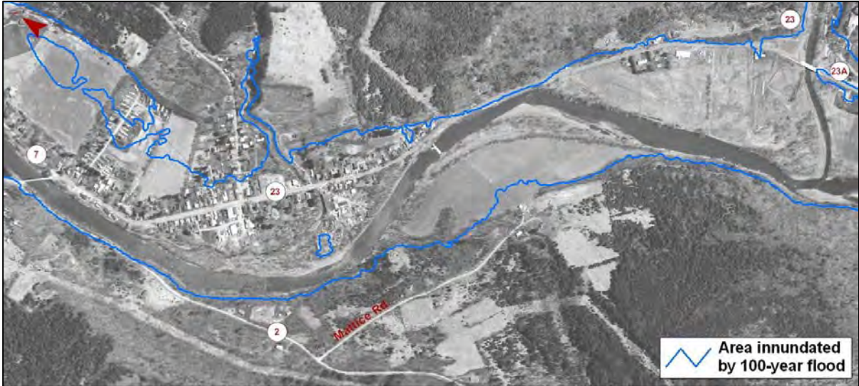
100-year floodplain boundary map

flood record. Most communities regulate the type of development that can occur in areas subject to these flood risks.