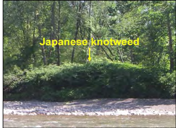
Japanese knotweed at Station 19300

invasive non-native species which does not provide adequate erosion protection due to its very shallow rooting system, and also its rapid growth rate crowds out more beneficial streamside vegetation. Large Japanese knotweed stands were documented throughout the management unit with Japanese knotweed present on almost half of the streambanks.