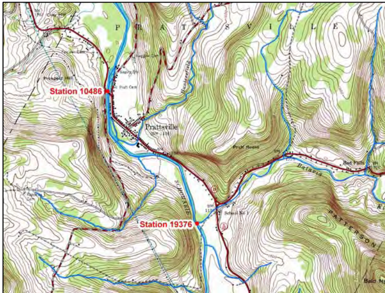
1980 USGS topographic map - Prattsville Quadrangle contour interval 20ft

Management unit #17 began at the Batavia Kill confluence. The drainage area ranged from 153.52 mi 2 at the top of the management unit to 236.48 mi 2 at the bottom of the unit. Drainage area increased significantly at the Batavia Kill confluence near the upstream end of the management unit. The valley slope was 0.24%.