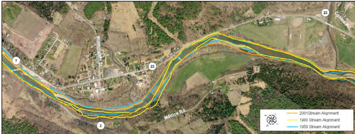
Historic stream channel alignments overlaid with 2006 aerial photograph

As seen from the historical stream alignments (below), the planform of the channel has remained fairly stable since 1959.