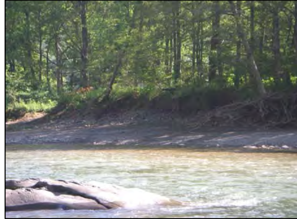
Bank erosion at Station 19100

The right streambank had scoured during high flow events along 211 ft (Station 19100). This type of erosion is common and may revegetate on its own with time. To speed up this process and increase bank stability native shrubs and sedges could be planted along the streambank and toe. In stable watersheds, the rate of erosion is slow and a natural healing process usually follows.