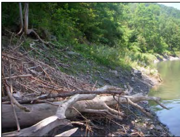
Bank erosion at Station 13650

Mature trees lined the top of the bank, however increasing the forested buffer width along the stream corridor by at least 100 feet will increase buffer functionality, such as filtering nutrients and pollutants, if any, from the adjacent commercial property. A high quality riparian buffer is especially important at this site because the adjacent commercial property is located within the 100-year floodplain. A dump site including large metal debris in the streambank was documented along this scour (Station 14100). To prevent introduction of this material, and any associated pollutants, into the stream the dump should be removed.