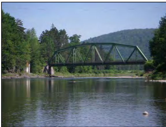
State Route 23 bridge in Prattsville - Station 10486

At the downstream end of this management unit the stream passed under the NYS Route 23 bridge in Prattsville (Station 10486). Gravel deposits upstream and downstream of the bridges were noted. Deposits such as these are commonly caused by inadequate sizing of