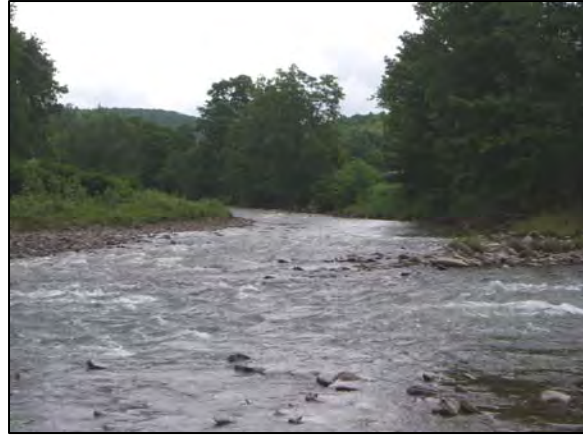
Batavia Kill tributary - looking upstream

Schoharie Creek at approximately 1,600 feet. As a result of this topography change, the tributary lost its ability to transport sediment gathered from the Batavia Kill Watershed, and began to deposit sediment at its mouth and into the Schoharie Creek. This is a common feature of confluence areas, which often contain extensive sediment bars, function as important sediment storage areas and are typically among the most