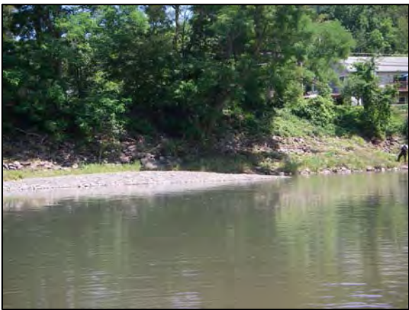
Rip-rap at Station 15150 - looking upstream

smallmouth bass populations over time (NYSDEC, 1993). The large pool created downstream by this structure serves as a popular swimming spot for residents. The concrete abutment had caused erosion on the left streambank upstream and downstream from the dam. Rip-rap had been installed along 66 ft of this bank but is unlikely to prevent future erosion at this site (Station 15300).