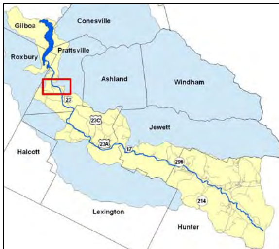
Management Unit 17 location see Figure 4.0.1 for more detailed map

10.6% of streambanks experiencing erosion 18.7% of streambanks have been stabilized 0% of streambanks have been bermed 1,056 feet of clay exposures 43 acres of inadequate vegetation 6,757 feet of road within 300 ft of stream 165 structures located in 100-year floodplain