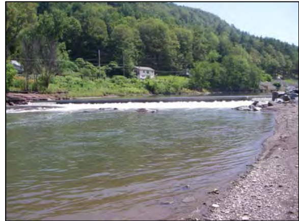
Dam at Station 15280 - looking upstream

1939, public disdain for the small, slow growing smallmouth bass of upper Schoharie Creek prompted the then NYS Conservation Department to construct a fish barrier dam across the Schoharie Creek to prevent the movement of bass upstream. In a 1981 study bass were generally less abundant than in previous studies, and also less abundant than trout above the barrier dam. The dam may have exerted some control on upstream