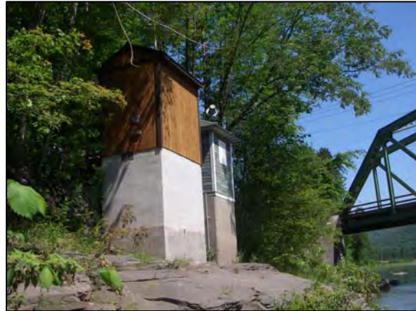
USGS stream gage #01350000 at State Route 23 bridge in Prattsville - Station 10600

A United States Geologic Survey (USGS) continuously recording stream gage was located on the left streambank approximately 100 ft upstream from the NYS Route 23 bridge in Prattsville (Station 10600). This gage (#01350000) has a drainage area of 237 mi 2 and has been collecting data from November 1902 to the present. All gage information including real time discharge and gage height is available online at the USGS website: