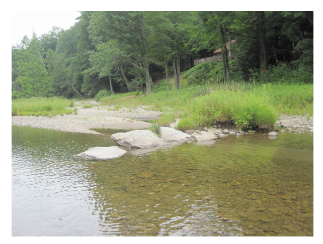
Boulder grade control (A289)

structure. (B280) Another grade control structure was observed 120 feet downstream at Station 3420. This structure in constructed of boulders and extends 29 feet into the channel angled upstream. It was documented as in good structural condition. There is a scour pool immediately downstream of this structure followed by a vegetated depositional side bar. (A289) The final structure is log cribbing embedded in the stream bed at Station 3200 which was documented in poor structural condition. (A294) The functional condition of these three structures cannot be assessed as their purpose and maintenance history remian unclear. Given the history of this section of the river as a fishing destination, it is likely that these control structures were designed to improve or enhance fish habitat, and likely contributed to sediment deposition in this reach. There is a residential structure on the right bank near Station 3300 that appears to be within the 100-year floodplain; the structure may also have been designed to encourage deposition and protect the nearby bank, on which the residence is located, from erosion.