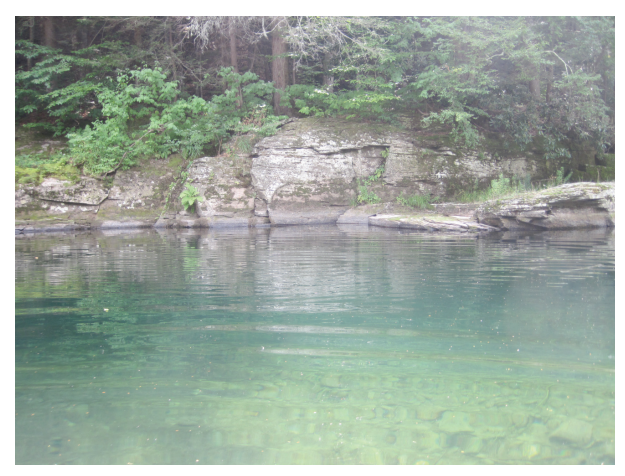
Big Bend Pool, scour pool against left valley wall bedrock (A280)