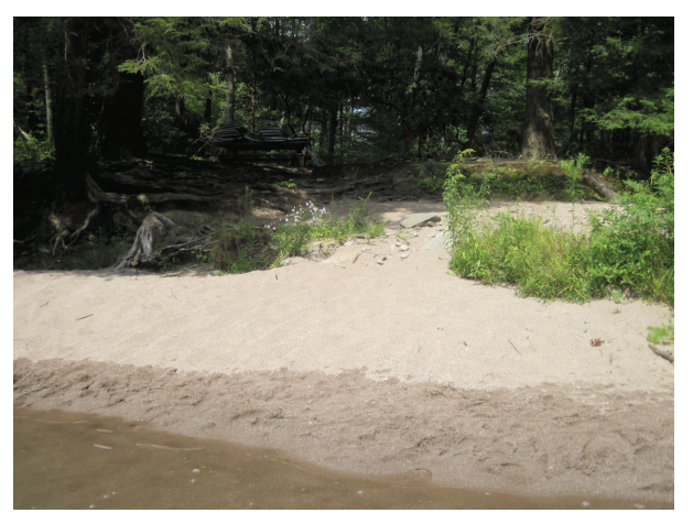
Downstream end of point bar, sand composition (A279)

channel diverges into the forested floodplain on the right bank. Although the channel was dry during the stream inventory, it appears to convey flow during high flow events as evidenced by some bank scour and debris patterns along the cobble channel bed. (A284) This side channel rejoins the mail channel at Station 3400 behind a vegetated cobble bar.