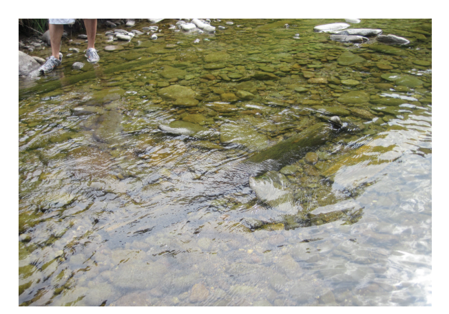
Log cribbing embedded in stream (A294)