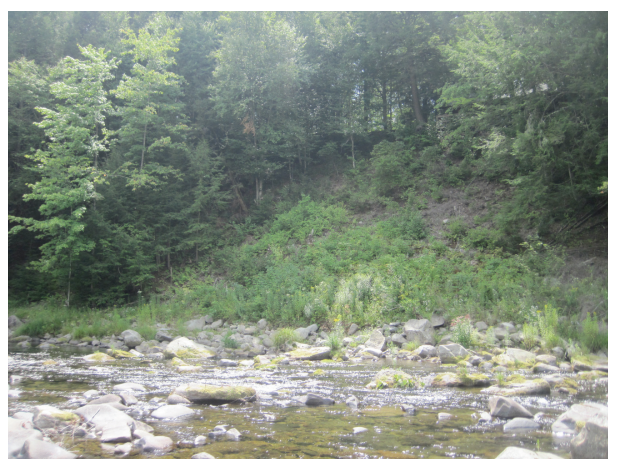
Hydraulic erosion on right bank with hardening at toe (A275)