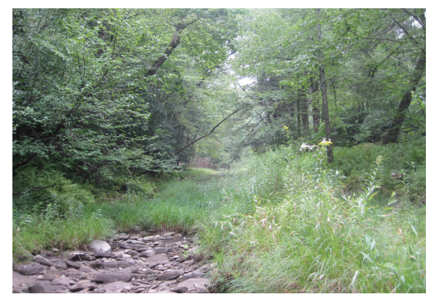
Divergence with side channel at right bank (A284)

Downstream of the convergence of the side channel a series of grade control structures was observed extending from the right bank. The first is a boulder grade control observed at Station 3500 extending approximately 47 feet at a right angle from the right bank. This structure was documented as in good structural condition. A scour pool has formed downstream of the control