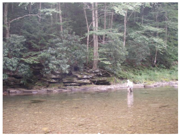
Exposed bedrock on left valley wall (B277)