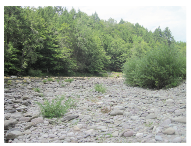
Cobble point bar and flood chute (A276)

For the remainder of the management unit the main channel is semi-confined , constrained by the bedrock on the left bank while maintaining connectivity to the floodplain on the right bank during flood events. At Station 4350 a side