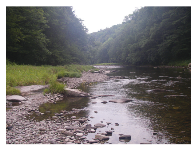
Scour pool downstream of headcut (B280)