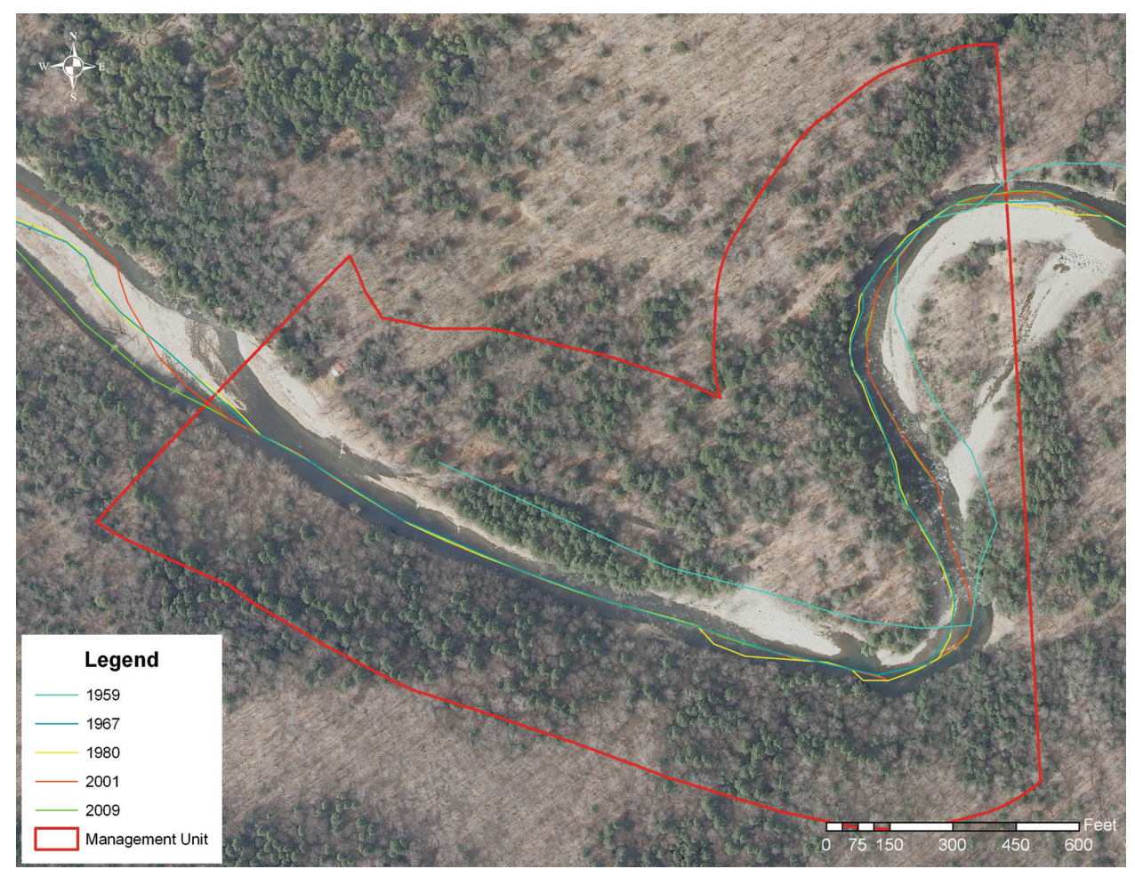
Historical channel alignments from five selected years (Figure 3)