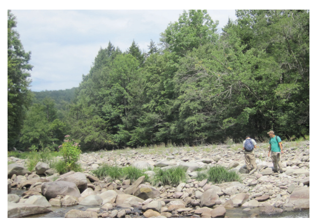
Convergence of side channel (B538)