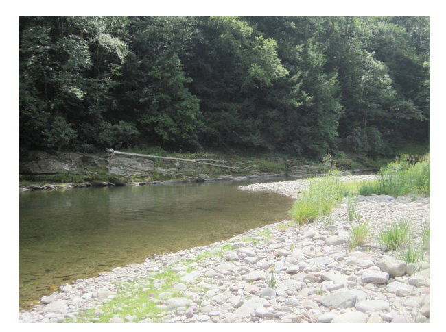
Upstream start of point bar, cobble composition (A278)