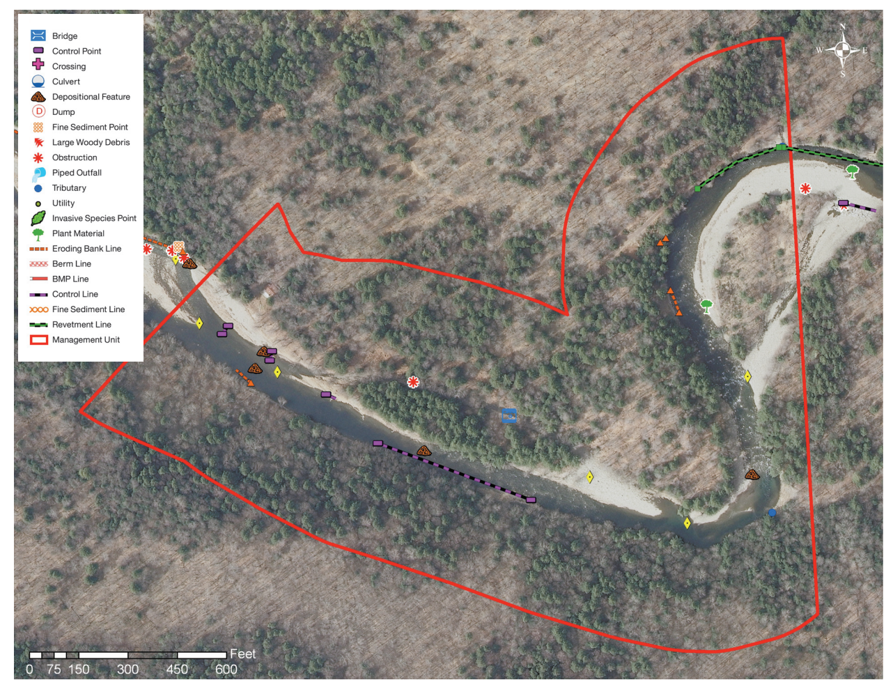
Stream Feature Inventory 2010 (Figure 1)