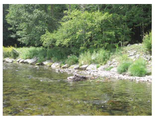
Sloped stone revetment on right bank (A270)

Another 100 feet downstream on the right bank, from Station 5700 to Station 5628 (BEMS NMB2_5600) a second eroding bank segment was observed with similar characteristics. Although it was slightly larger at 35 feet high and 72 feet long, it was also caused by hydraulic erosion perpetuated by fluvial entrainment exposing alluvial materials. Vegetation and large boulders were contributing to hardening at the toe and woody vegetation was observed from the toe all the way to the crown of the bank failure.( A275 )