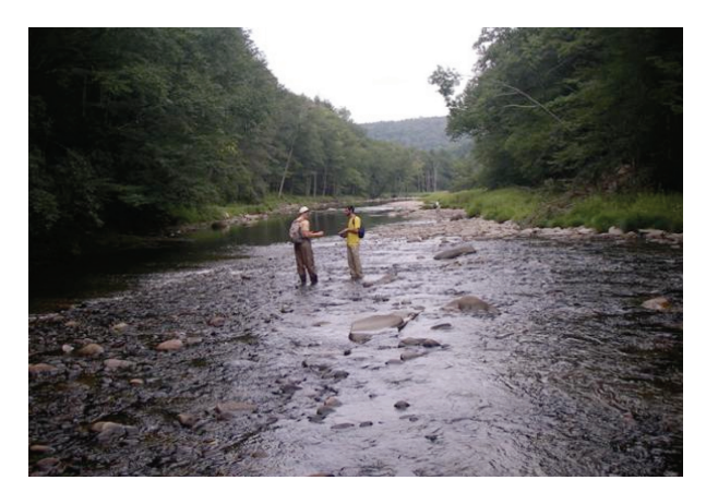
Transverse bar and headcut migrating upstream (B275)