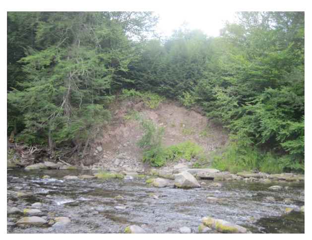
Right bank failure (A272)