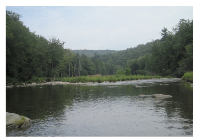
Divergence around cobble center bar (A293)

represent a significant source of turbidity. It is anticipated that this bank will stabilize without treatment ( passive restoration ), however, it is recommended that this site be monitored for changes in condition.