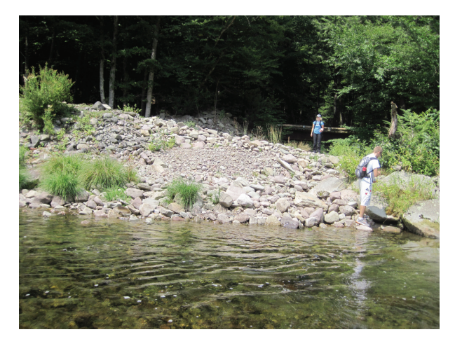
Dry Brook Confluence (A269)

the revetment at the upstream and downstream ends. This revetment appears to protect the private road used to access the cabins on the stream bank upstream of the Dry Brook confluence. (A270)