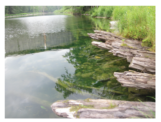
Timber structure creating pool for fish habitat (A182)

A covered bridge, located at Station 17320, was documented as in good functional condition and fair structural condition with scour documented behind the right abutment. The bridge has a normal and effective span of 108 feet, and encroaches two feet on the right bank and four feet on the left bank. It is constructed of wood timbers with bridge approaches supported by stone abutments. The bridge was identified as County Bridge 192C, and appears to be open for pedestrian traffic based on trails observed nearby and officially remains a town road. This bridge, known as the Halls Mills bridge locally, was in active use as the primary access point for all the residences on the west side of the river until the