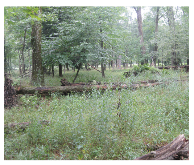
Woody debris on right bank flood plain (A185)

Hunter Road bridge upstream was constructed in 1962. (B486)