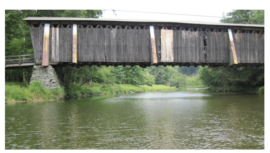
Halls Mills Bridge (B486)

According to the Sullivan County Department of Public Works the bridge is scheduled for scour repair but the project is on hold due to lack of funding. In addition, bank retreat on the right bank indicates that the channel may be enlarging at this location