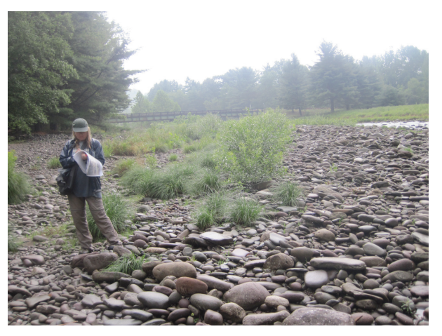
Looking upstream at right bank cobble point bar (A171)

Recommendations for this segment of bank with minimal riparian buffer include assisted restoration of revetted bank using bioengineering techniques to inter-plant and further revegetate the eroding bank and provide additional stabilization. The willow growing on the side bar on the inside of this meander could provide a source of materials for the restoration effort.