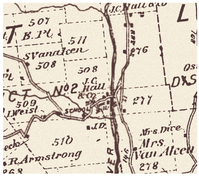
Excerpt from 1875 Beers Map (Figure 2)

As the glaciers retreated about 12,000 years ago, they left their "tracks" in the Catskills. See Section 2.4 Geology of Upper Neversink River , for a description of these deposits. These deposits make up the soils in the high banks along the valley walls on the Neversink mainstem and its tributaries. These soils are eroded by moving water, and are then transported downstream by the River. During the periods when the forests of the Neversink watershed were heavily logged for bark, timber, firewood and to make pasture for livestock, the change in cover and the erosion created by timber skidding profoundly affected the Neversink hydrology and drainage patterns.