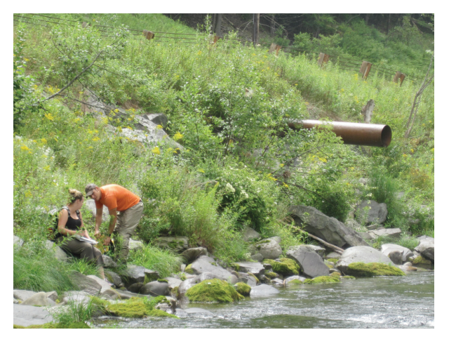
Piped outfall and rip-rap on left bank adjacent to Claryville Road (B479)