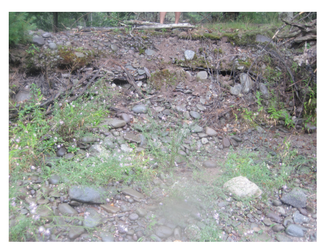
Sedge and alluvial material at right bank erosion point (A176)