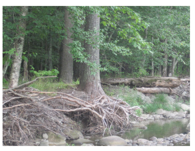
Woody debris jams increasing scour on left bank (B373)