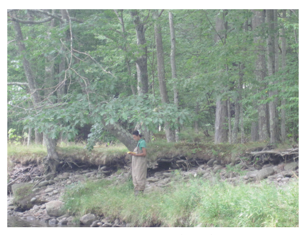
Actively eroding left bank segment (B370)