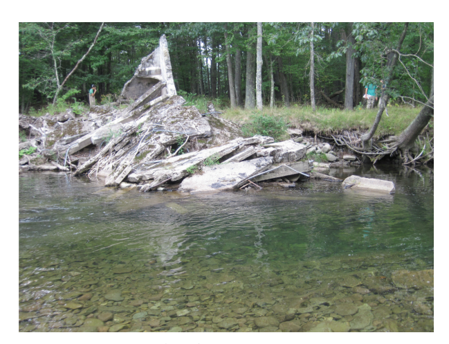
Construction debris (A24)

A flood chute was observed diverging into the floodplain on the left bank near Station 1000,