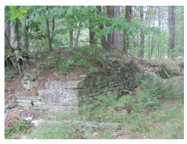
Toppled foundation on left bank (B367)