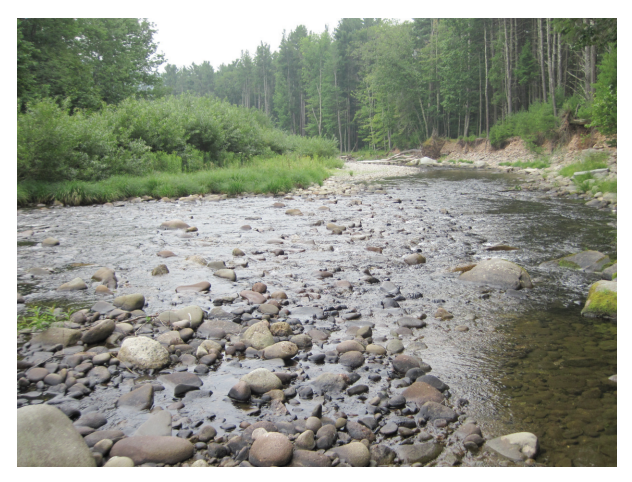
Transverse bar spanning channel width (A35)

Two distinct eroding bank segments were observed on the right bank on the outside of this meander bent. The first extends 60 feet from Station 760 to Station 700 (BEMS NWB1_700). This site was documented as inactive with grass and sedge vegetation observed on the slope and hardening at the toe. However, the eroding bank segment from Station 760 to Station 400 (BEMS NWB1_400)