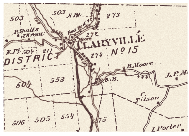
Excerpt from 1875 Beers Map (Figure 2)

The 1875 Beers Atlas of this area indicates that by that time, the stream had been harnessed for manufacturing, primarily saw mills,