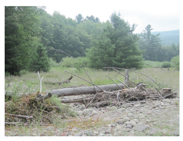
Cobble point bar on left side of channel (B381)