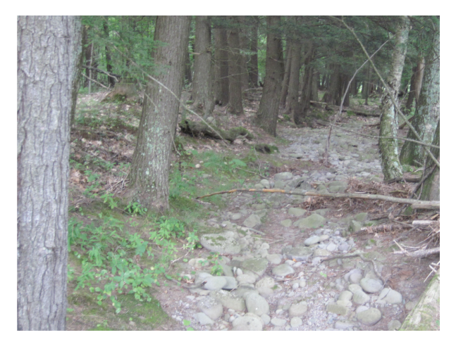
Flood chute on left flood plain (B375)