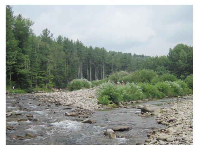
Eroding right bank segment (A42)