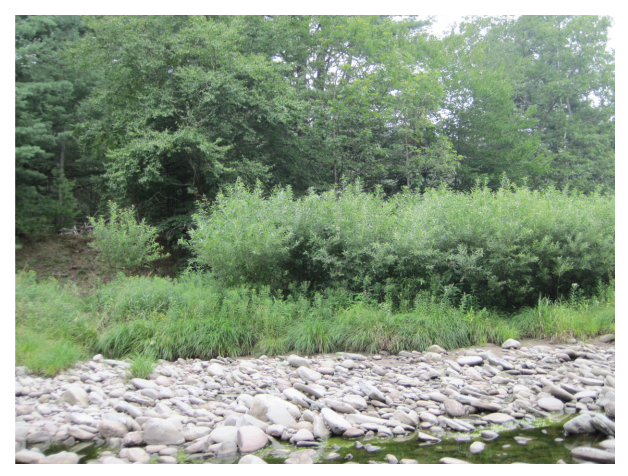
Potential willow harvest source (A29)

apparently diverted by a woody debris jam. Across from this divergence, a side channel conveying flow form the right floodplain joins the main channel around a cobble depositional bar vegetated with willow. This willow was documented as a potential plant source for restoration project in the watershed, and could potentially be used for assisted restoration of the eroding bank segment slightly upstream on the left bank. (B375, A29)