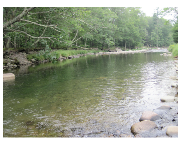
Pool at topple foundation site (A23)