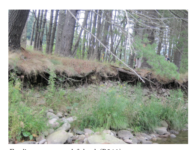
Eroding segment on left bank (B361)