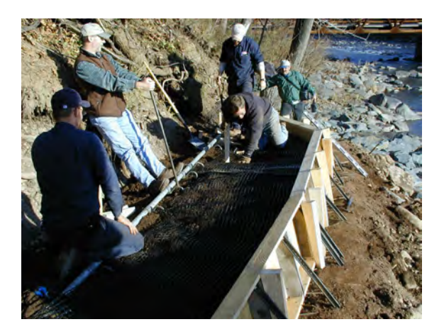
Figure 18. Constructing VRSS with batter boards (11.11.03).