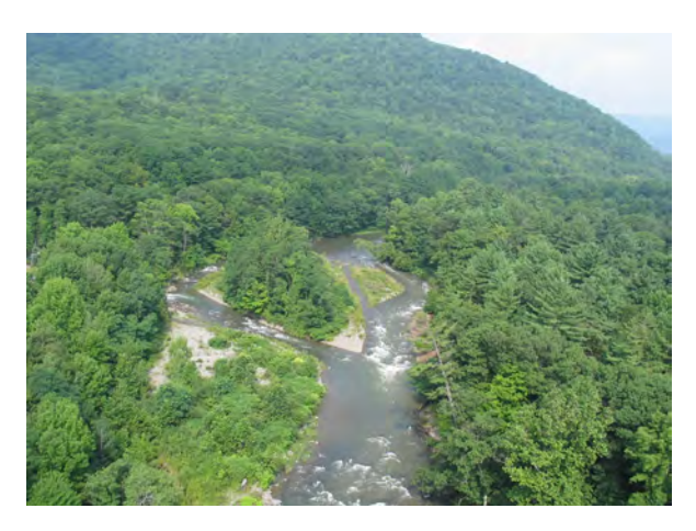
Figure 2. Aerial view of project reach (8.13.03)

The project site is an approximately 1,000 ft section of Esopus Creek in the Town of Shandaken, Ulster County, NY (Figure 1). This section of Esopus Creek at the Woodland Valley creek confluence is approximately 10 miles upstream of the Ashokan reservoir and has a long history of channel instability (shifting and braided channels, eroding banks). Extreme floods during the 1980's and 1990's caused channel avulsion around the confluence with Woodland Valley creek resulting in an unstable braided channel partly bypassing the Woodland Valley creek (Figure 2). The new channel, a cutoff chute,