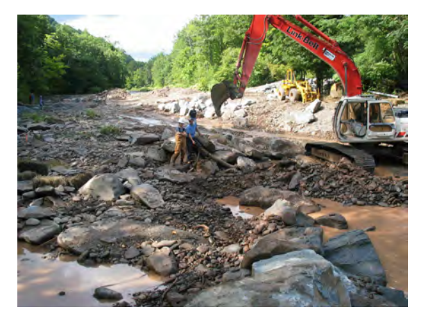
Figure 7. Excavating new channel and constructing rock vane (9.x.03)