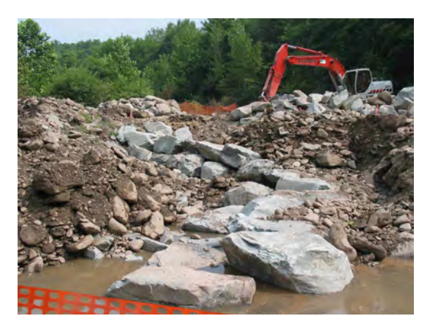
Figure 6. Constructing rock vane and weir below Woodland Valley confluence (8.20.03)