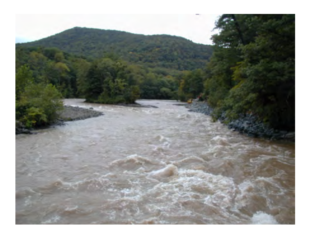
Figure 14. Post-flood flows at project reach (9.23.03)