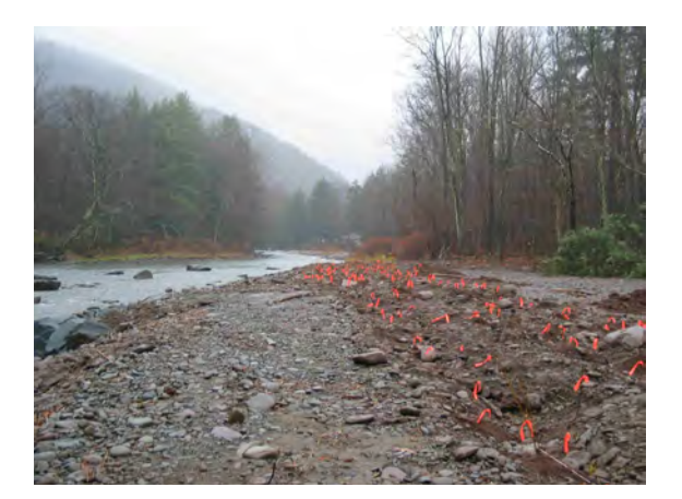
Figure 16. Tree plantings along the new channel margin (11.19.03)