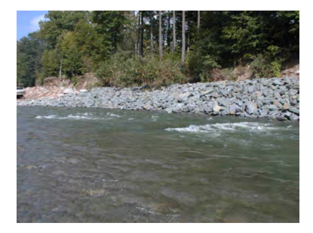
Figure 12. Rip rap revetment along failing bank (9.24.03)