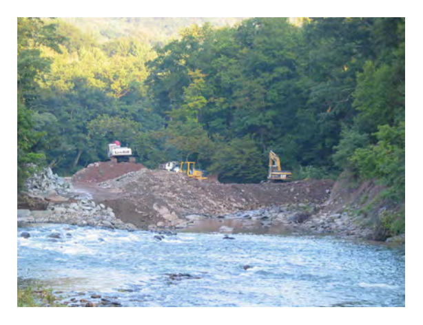
Figure 10. Filling in cutoff channel (9.17.03)