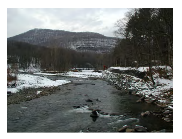
Figure 21. Completed Project (12.12.03)