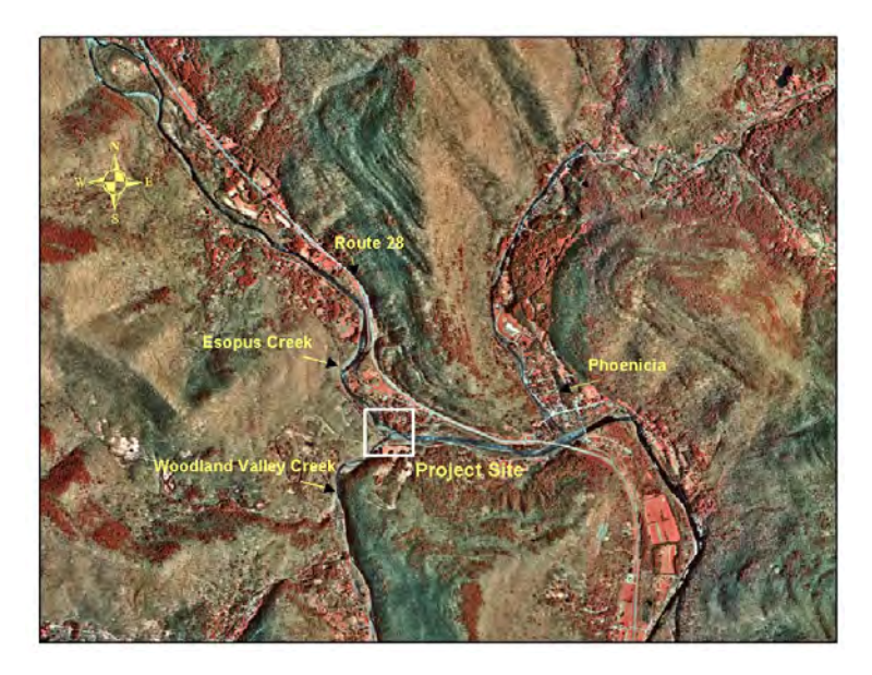
Figure 0. Project site location map

Esopus Creek in the Catskill Mountains is the main stream that flows into the Ashokan reservoir – a primary source of water for New York City. The Esopus Creek watershed delivers high quality water, yet during storm events clay can be eroded from streambanks and as a result the water becomes turbid. As part of the Filtration Avoidance Determination deliverables to USEPA, the DEP Stream Management Program, in conjunction with County Soil and Water Conservation Districts, has been developing stream management plans and constructing stream restoration projects that demonstrate the use of natural channel design practices. The primary purpose of the plans and restoration projects is to improve the water quality of the streams that feed the NYC water supply reservoirs. This report summarizes the development and completion of a demonstration project on Esopus Creek.