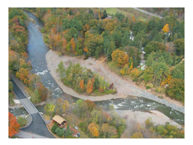
Figure 15. Aerial view of project reach after channel restoration (10.16.03)