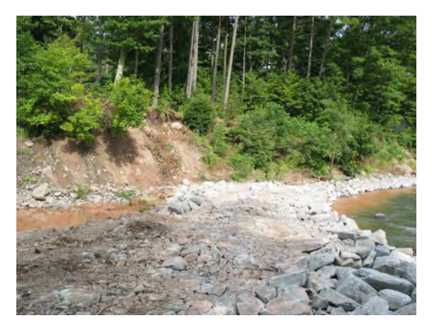
Figure 11. Constructing downstream channel block (9.18.03)