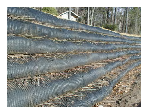
Figure 20. VRSS - geotextile encapsulated soil lifts with layered willow whips (12.05.03)