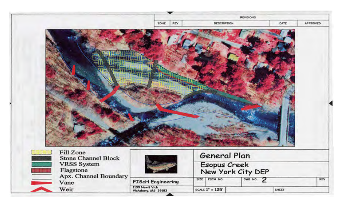
Figure 4. Original conceptual design. Final design is slightly different with changes in weir location and orientation and one rock vane moved just downstream of Woodland Valley.

In 2002 NYCDEP commissioned an assessment of the reach and a proposed plan for stabilizing the stream reach. Dr. Craig Fischenich of FIScH Engineering proposed a restoration design which incorporated observations of the Esopus Creek in more stable locations as well as analytical calculations of sediment transport and flooding potential. The plan included restoring the stream to the previous channel, building rock structures to control erosion, filling the cut-off channel to floodplain elevation, and stabilizing the eroding bank with rip-rap and vegetation (Figure 4).