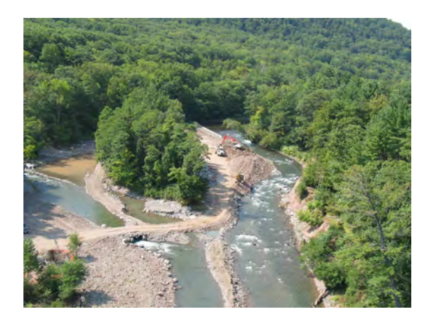
Figure 9. Aerial view of project construction (9.11.03)