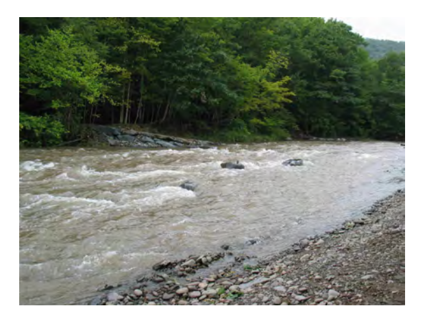
Figure 9. Streamflow in new south channel (9.19.03)