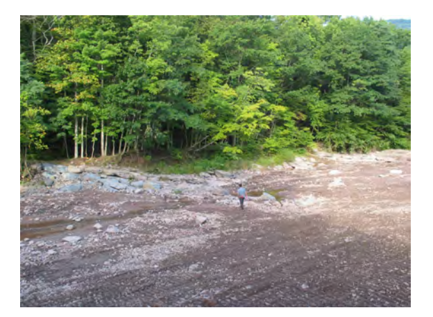
Figure 8. Completed south channel with upstream weir (9.09.03)