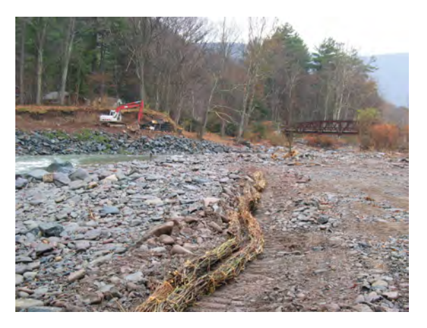
Figure 17. Willow fascine placement along cobble bar (11.19.03)