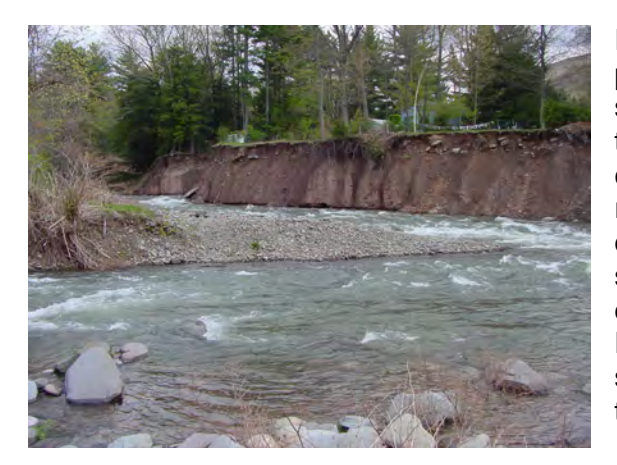
Figure 3. Streambank failure along project reach (May, 2002)

became the main channel eroding into glacial lake clays and exposing a highly erodible bank of clay-rich glacial deposits. Since 1996 the eroding bank has extended to ~500 ft in length, migrated on average 3 ft/yr, and has reached a height of 20-25 feet (Figure 3).