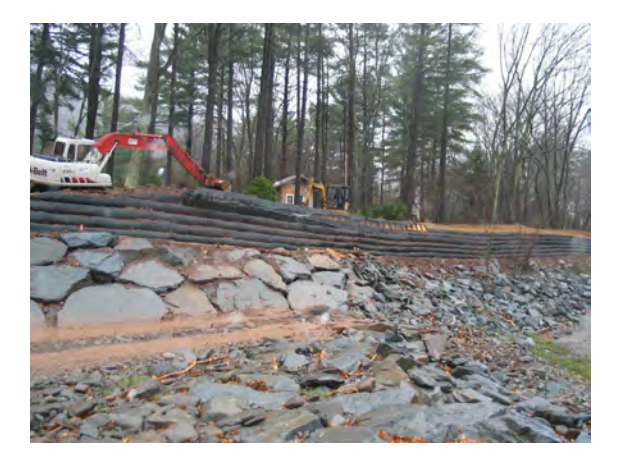
Figure 19. VRSS on top of rip rap at downstream channel block (11.24.03)