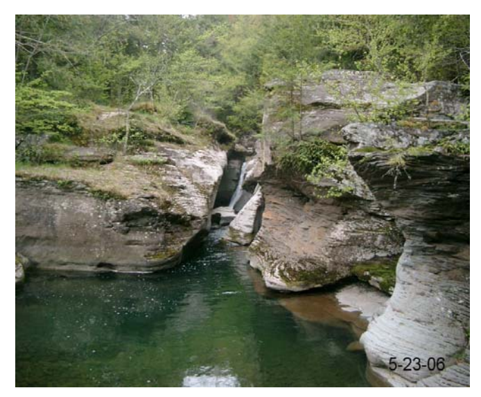
An example of a stream down-cutting through a bedrock outcrop.

The occurrence of bedrock also directly affects streams wherever the stream channel contacts bedrock instead of stream deposits. In such places, rates of stream channel downcutting, bank instability and lateral migration are dramatically reduced.