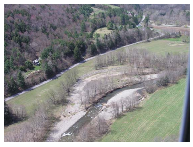
An example of channel migration and gravel deposition on a tributary.

Stream stability and sediment transport processes are a significant issue for landowners and managers of the resource in the basin. While the mainstem of the East Branch Delaware River has a stream bed that is compose largely of gravel and fine sediments, the tributaries are cobble bed streams that often move large amounts of bedload during high flows. The mobilization and deposition of this bedload in large gravel bars is a significant management concern for stream managers, highway superintendents and landowners in the basin.