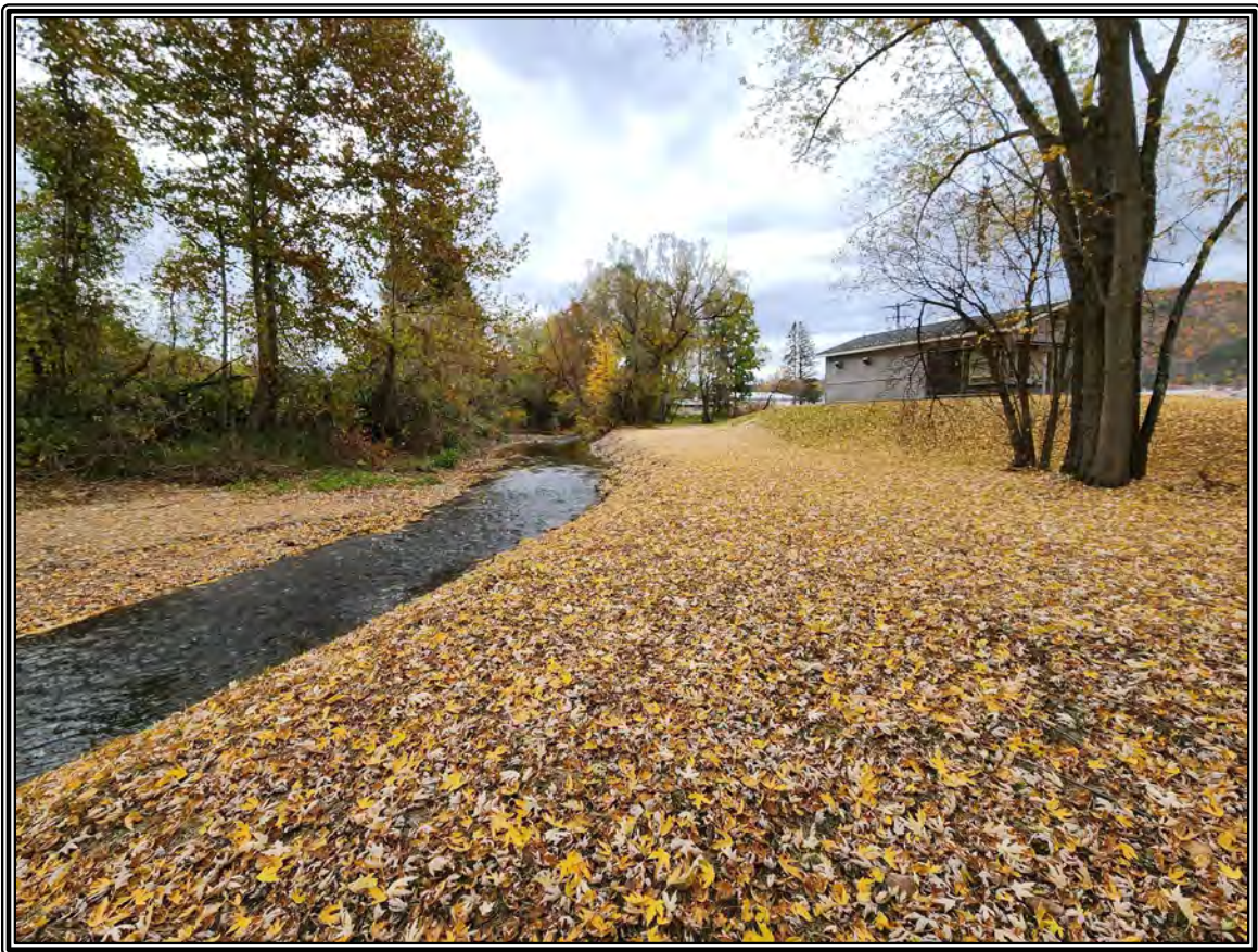
West Brook at Village Well Bank Stabilization Project, Village of Walton, NY constructed in 2022

Prepared by: DCSWCD Stream Program April 2023